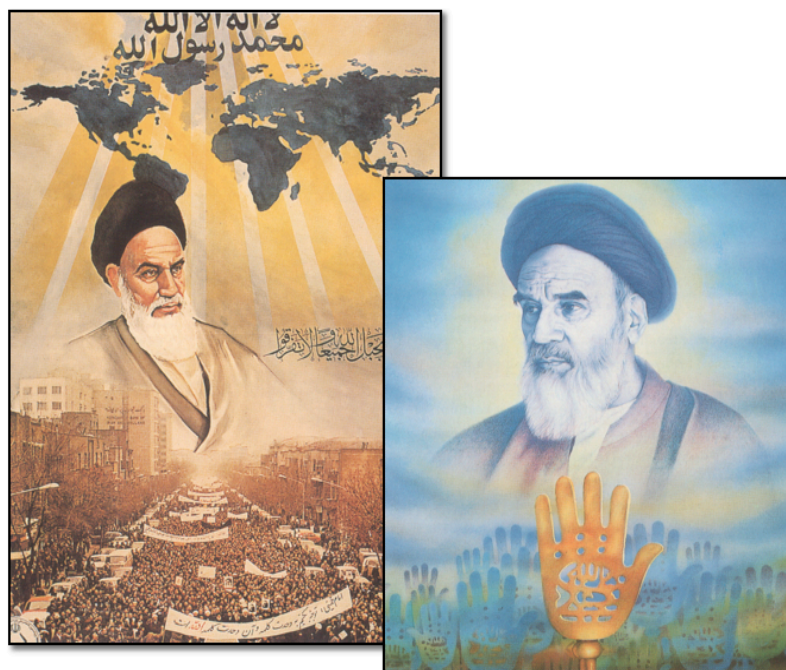
Figure 10. Revolutionary Posters Depicting Khomeini's "Brilliance" 41

forth from the sky, emanating from the sun as if surrounded by a halo." 42 Even western observers related stories about his radiance; the political economist Marvin Zonis states: "There is a light around Ayatollah Khomeini. I think it is only the power of that charisma that has made it possible to overcome the differences among the clerics." 43