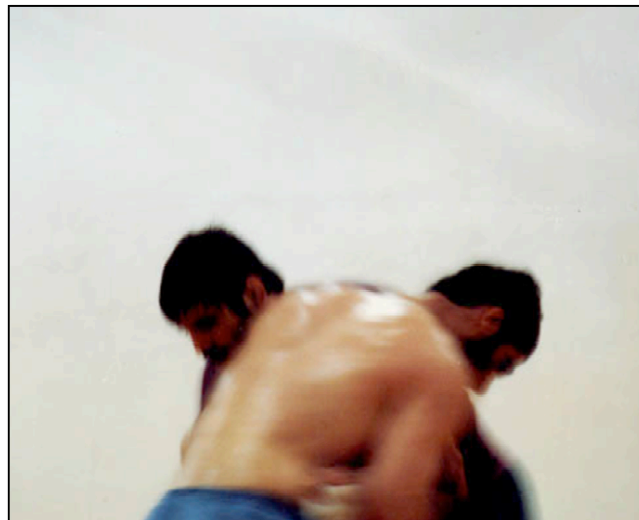
Figure 12. Fereydoun Ave's 2004 "Rostam and Sohrab" 16