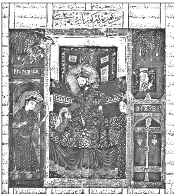
Figure 5. Bahram Gur appoints Narsi Viceroy of Khurasan 72

formally appointed his brother Uljāyту, also the viceroy of Khorāsān, his successor. The illustration was intended not only to compare the Il Khanids to the ancient Iranian kings, but also to bolster a false claim by the vizier Rashid-od-din Fazlollāh that Ghazan had formally named his brother as his heir five years before his death. The royal brothers are shown with shining halos that symbolize their farr, which is applicable to both the Shahnameh and the “true” story. 71