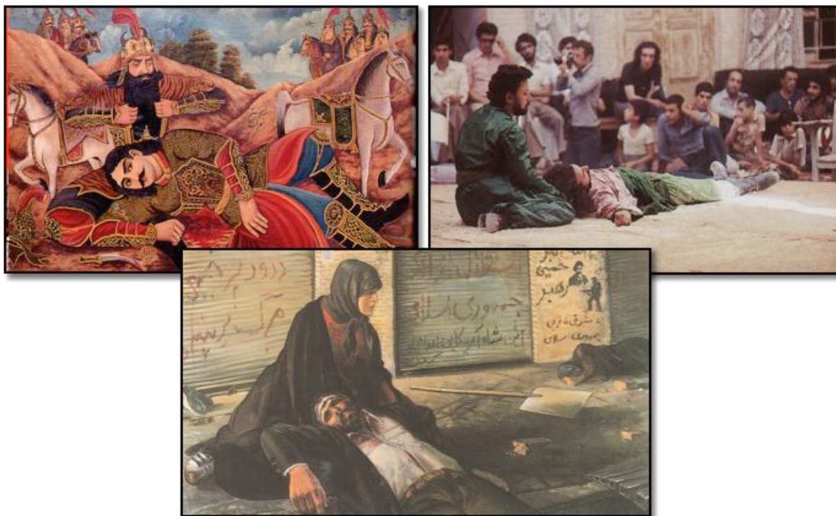
Figure 7. Classic Coffee House Painting Depicting an Episode in the Shahnameh ; a Scene from a Ta'zieh; and a Poster from the Islamic Revolution 23

the hundreds of others killed throughout the year, were granted martyrdom status that placed them alongside Iran's heroes from both the ancient and Islamic eras. 22