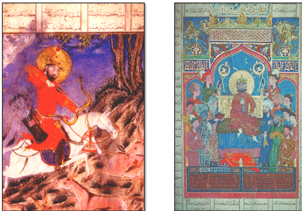
Figure 4. Illustrations from the Abu-Sa'id Shahnameh 69

The Il Khanids also adapted and exploited the Shahnameh's general themes, many of which “conformed to Mongol history and traditions, and provided a common ground between Mongol and Iranian epic history” to strengthen Mongol legitimacy. 70 The images in the Abu-Sa'id Shahnameh illustrate episodes in Mongol history as well as the stories originally told in Ferdowsi’s epic. Figure 5 is an excellent example of this union. It depicts the Shahnameh story about the Sassanian king Bahrām-e Gur and his brother Narseh, the viceroy of Khorāsān; as well as the tale of how the Il Khanid Shah Ghāzān