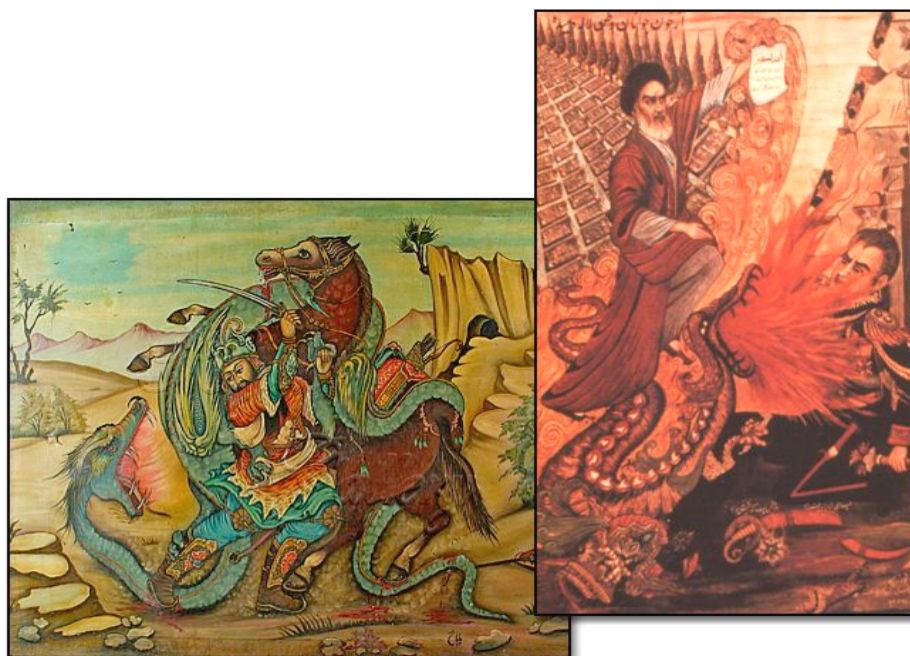
Figure 9. Rostam in Coffee House Painting; Khomeini in Revolutionary Poster 34

As Khomeini's reputation spread beyond the bazaar, it became clear to a growing number of the members of the organizations opposing the Shah that Khomeini was the latest in the line of just rulers endowed with the farr-i izadi , and that he was ready to assume his place as the rightful ruler of Iran. Khomeini fit the characteristic pattern for founders of Iranian temporal dynasties as defined in Iranian mythology, specifically in the Shahnameh . 35 He exhibited signs of greatness when the nation was faced with the peril created by a tyrannical leader. Like many of the ancient kings and heroes, he was