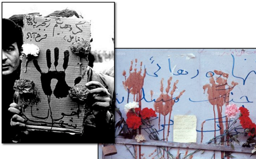
Figure 8. Blood of the Martyrs 26

extent that they put their own bloody handprints—a familiar symbol from the ta'ziyeh—on placards and into graffiti. 24 This passion sustained the demonstrations that ultimately led to the Shah's abdication and flight from Iran in January of 1979. 25