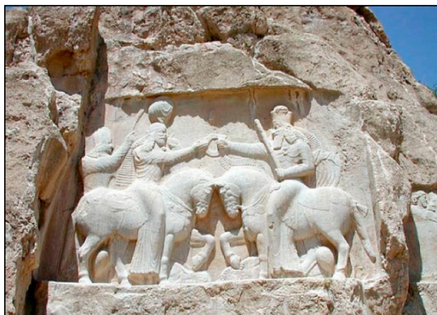
Figure 1. Relief at Naqsh-e Rostam, “Ardashir Receiving the Farr” 9

The farr of the Iranians was thereafter considered the property of the Iranian people. It was inextricably bound to the destiny of each individual, allowing him to carry out the duties appropriate to his social class. A man’s farr was linked to his intelligent soul, and its vitality depended on his spiritual awareness—he could strengthen it through strict observance of religious beliefs and rituals and by increasing his wisdom and virtue. The king, as a member of the Iranian nation, also held this personal farr; “king” originally “meant a man capable of realizing, in full awareness, his own destiny by developing his inborn khvarenah”—what modern Iranians refer to as ṣafā-ī bāṭin , inner purity or sincerity of mind and heart. 10