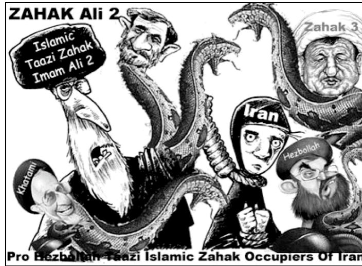
Figure 11. 2007 Political Cartoon with Allusions to the Shahnameh 15

easily accessed by anyone with an Internet connection as new nationalist movements with democratic ideals challenge the Islamic government using the same persistent symbols.