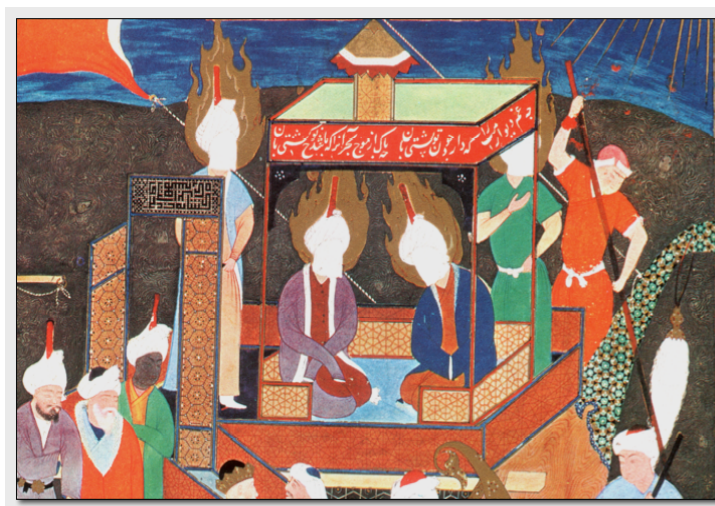
Figure 3. Muhammad and the First Three Imams Crowned with Light 49

Throughout these changes in religion and leadership, the farr acquired a variety of post-Islamic representations and titles based on the old Sassanian concept present in the collective Iranian consciousness; however, its most enduring icon is illumination. 48 The pre-Islamic farr was symbolized by a corona of light or fire around the king's head, and this representation persisted in Iran after the introduction of Islam. Figure 3, an