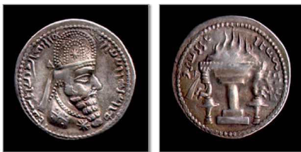
Figure 2. Sassanian Drachm; Ardashir I (224 - 242 AD) and Zoroastrian Fire Alter. 13

This ideal association was commonly illustrated on Sassanian coins, with the bust of the leader on one side, and the Zoroastrian fire alter on the other, thus making “church” and “state” literally two sides of the same coin. 12