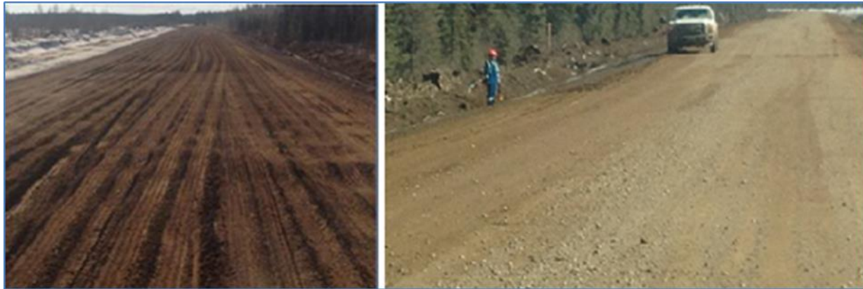
Figure 3: Driving condition on C-road a) before and b) one year after construction