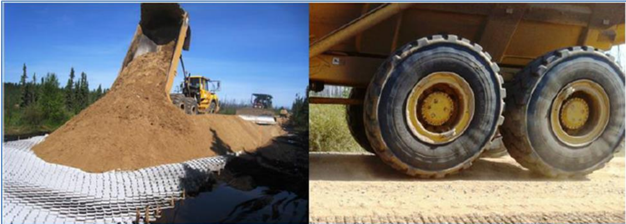
Figure 2: P-3 connector a) during construction and b) during the heavy traffic operation