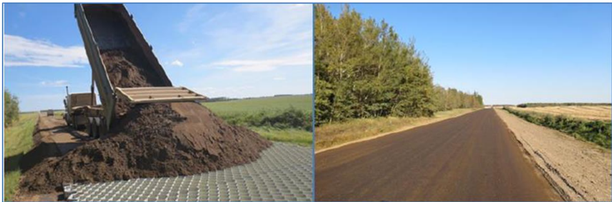
Figure 5: Township road 762 in MD of Smoky River County during a) construction and b) after operation