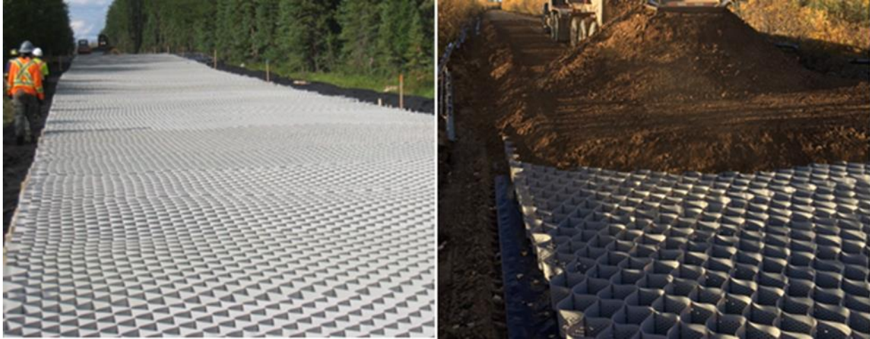
Figure 1: Geocells stretched and being infilled