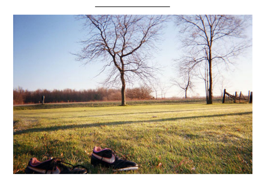
Figure 2: Photograph 1 – Big backyard