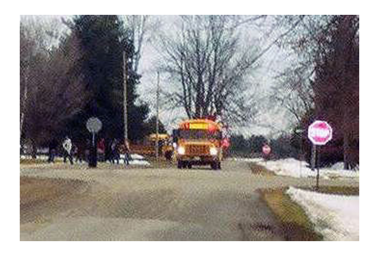
Figure 4: Photograph 3 – Depending on the bus

The International Electronic Journal of Rural and Remote Health Research, Education Practice and Policy