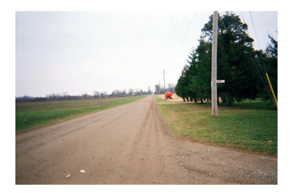
Figure 3: Photograph 2 – Unfit for physical activity

The International Electronic Journal of Rural and Remote Health Research, Education Practice and Policy