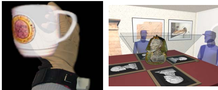
Figure 1: An occlusion example (left); the planar reflection of Virtual Showcases (right)

This phenomenon can be described as follows: when interacting with the augmented environment, the user's hand and other real objects can hide the projected image, thus making it impossible to have a virtual object closer than the hand. One potential solution for the problem is to project the image between the eyes of the viewer and the real objects in order to avoid the occlusion problem. For better understanding this, we can imagine two of the following situations that may occur: in the first one the hand or arm of the user is always on front of virtual object, while in the second one, they are always behind of virtual object (see Figure 1). In both cases the user loses eye contact, thus information, with part of the AR scene (virtual or real).