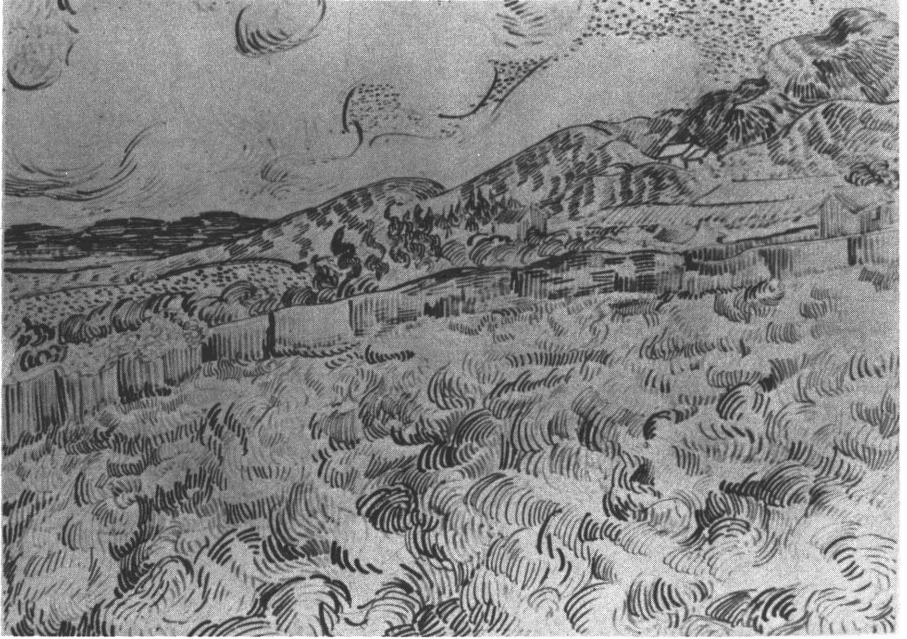
Figure 5: Van Gogh, “Cornfield with Hills” (1889). Stedelijk Museum, Amsterdam.

In the poem Van Gogh quotes in the title of “Starry Night,” Whitman recognizes the “dazzling orb” as a “twin” or token of himself. Speaking to the sun on terms of friendly equanimity, he asks it to guide the twilight of his life as it has guided his “hot . . . noon”: