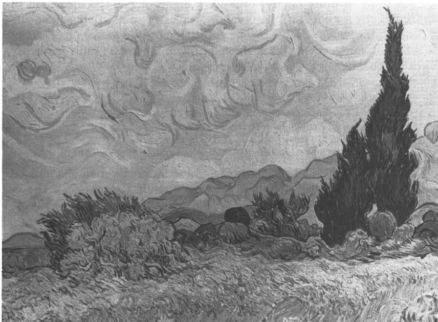
Figure 6: Van Gogh, "Wheatfield with Cypress" (1889). National Gallery, London.

"Line in nature is not found; Unit and universe are round; In vain produced, all rays return; Evil will bless and ice will burn." As Uriel spoke with piercing eye, A shutter ran around the sky. . . . The balance beam of fate was bent; The bounds of good and ill were rent. (Emerson, "Uriel," ll. 21-32)