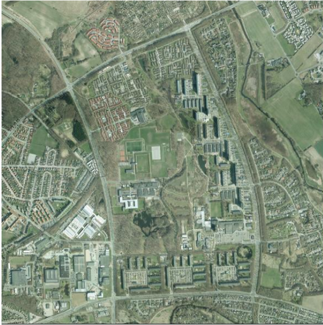
Fig 1. Aerial photo of Vollsmose

associations. When Vollsmose was planned and developed in the 1960's it represented the modernist "machine for living", providing modern flats of a comparatively high standard, social services such as schools and nurseries and vast green recreational areas. Accordingly, the infrastructure within the area is geared towards to pedestrians and cyclists and there is a sheer absence of access roads for cars. Motor traffic is directed around Vollsmose and in effect the area is bordered by large roads. Hence Vollsmose also has become known as "the square".