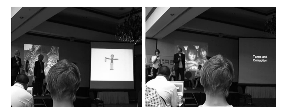
Figure 1: Examples from their final presentation

group therefore had relatively vague ideas and conceptualisations of poverty when they arrived in Costa Rica, and they were not entirely sure how to define and address their problem. Their concrete work then really began on 7 August (in the evening) where they started to create interview guides and discuss ideas for the presentation. It was concluded on 10 August when they presented their findings to the symposium attendees.