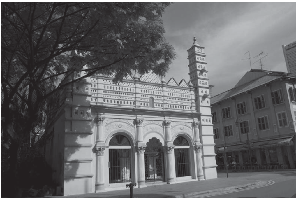
FIGURE 2: The Nagore Dargha, Telok Ayer Street, Singapore, built ca. 1828–1830.

the wider Islamic world, they also became active sites of devotion and healing, attracting local worshippers far beyond the Tamil Muslim community, just as the original shrine in Nagore had always attracted a majority of Hindu devotees. 19 The narrative of his life intimately connected with the sea, Shahul Hamid was an apt patron saint for mobile peoples. 20