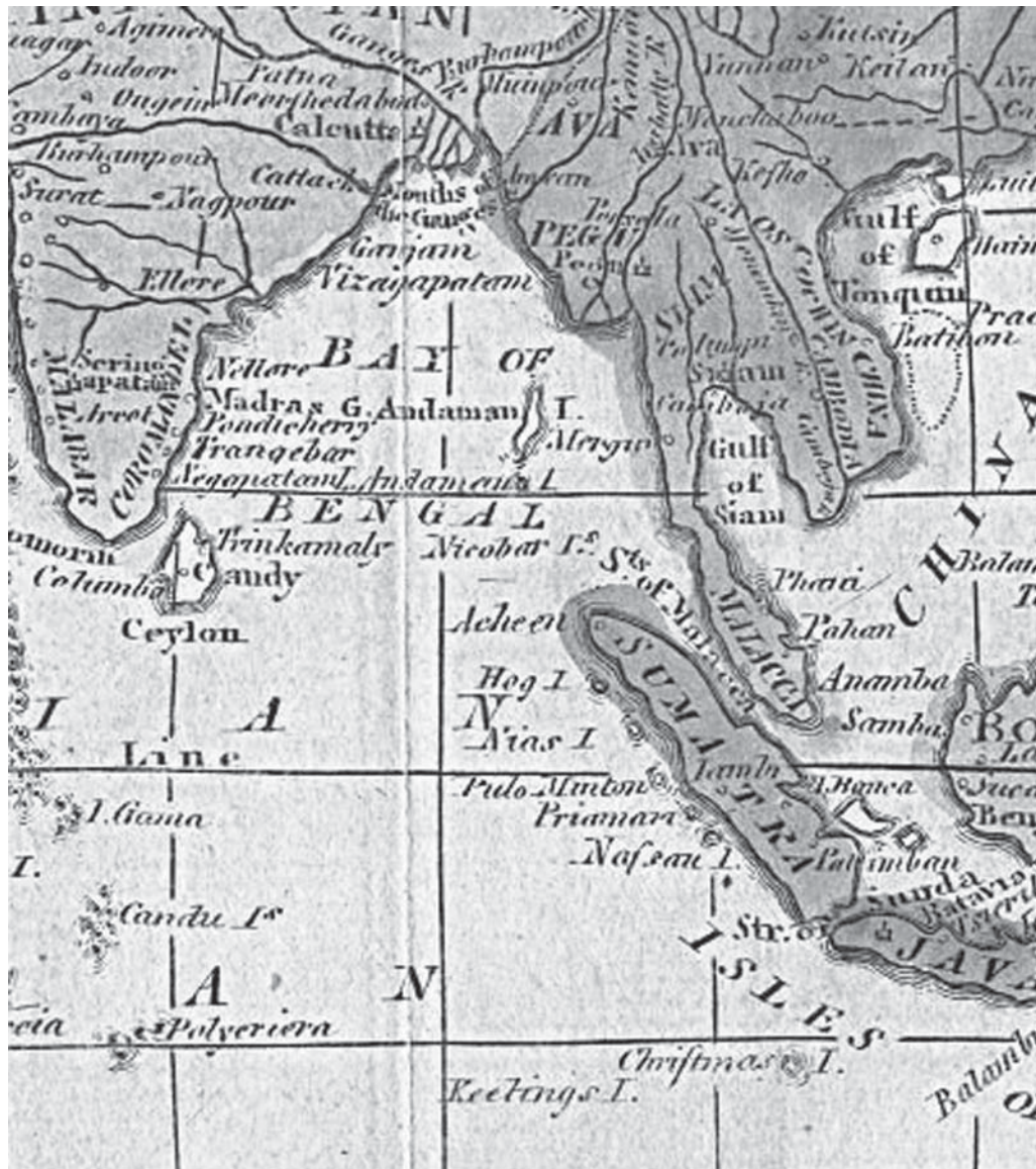
FIGURE 1: The Bay of Bengal region ca. 1800, showing the ports of departure on the Coromandel Coast. Detail from "Asia," in R. Brookes, The General Gazetteer; or, Compendious Geographical Dictionary , 8th ed. (Dublin, 1808).

Bengal. The dargha of Nagore also had a striking influence on the structure of the Masjid Jamae (or "Big Mosque"), the largest Tamil Muslim place of worship in Singapore.