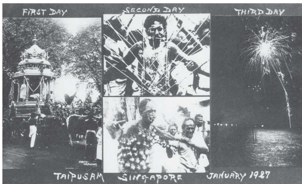
FIGURE 6: Postcard featuring thaipusam festivities in Singapore, ca. 1927.

tinuing, even intensifying, their acts of public devotion. 85 Thaipusam and the fire-walking penance of thimithi continued to flourish despite the efforts of the reformists, who would “stand on the street corner and shout anti-religious slogans.” 86 L. Elizabeth Lewis, an American writer for National Geographic Magazine , visited Singapore in the early 1930s to witness the performance of the thimithi and thaipusam rites, and found that they were performed with an immense power of belief and devotion. Observed by “thronged” crowds of “Hindus, Chinese, Malays and others,” the thimithi ceremonies involved acts of willed pain and endurance. “The priests would sometimes strike the devotee several times,” Lewis observed, “and then give the wrist a stinging blow before releasing him” to “dash, bare-footed, across the red-hot coals into the pool of milk.” Observing thaipusam the same year, Lewis wrote that “faith in the efficacy of these ceremonies is absolute.” She described a “martyr” being prepared for his three-mile “pilgrimage” to the Tank Road Temple by “thrusting pins into his flesh. His chest, his back, his forehead and his thighs were entirely covered with small, shining, V-shaped pins.” 87 Similar processions took place in Penang and, perhaps most dramatically of all, in Kuala Lumpur, where they culminated in the Batu Caves (as they do to this day). 88