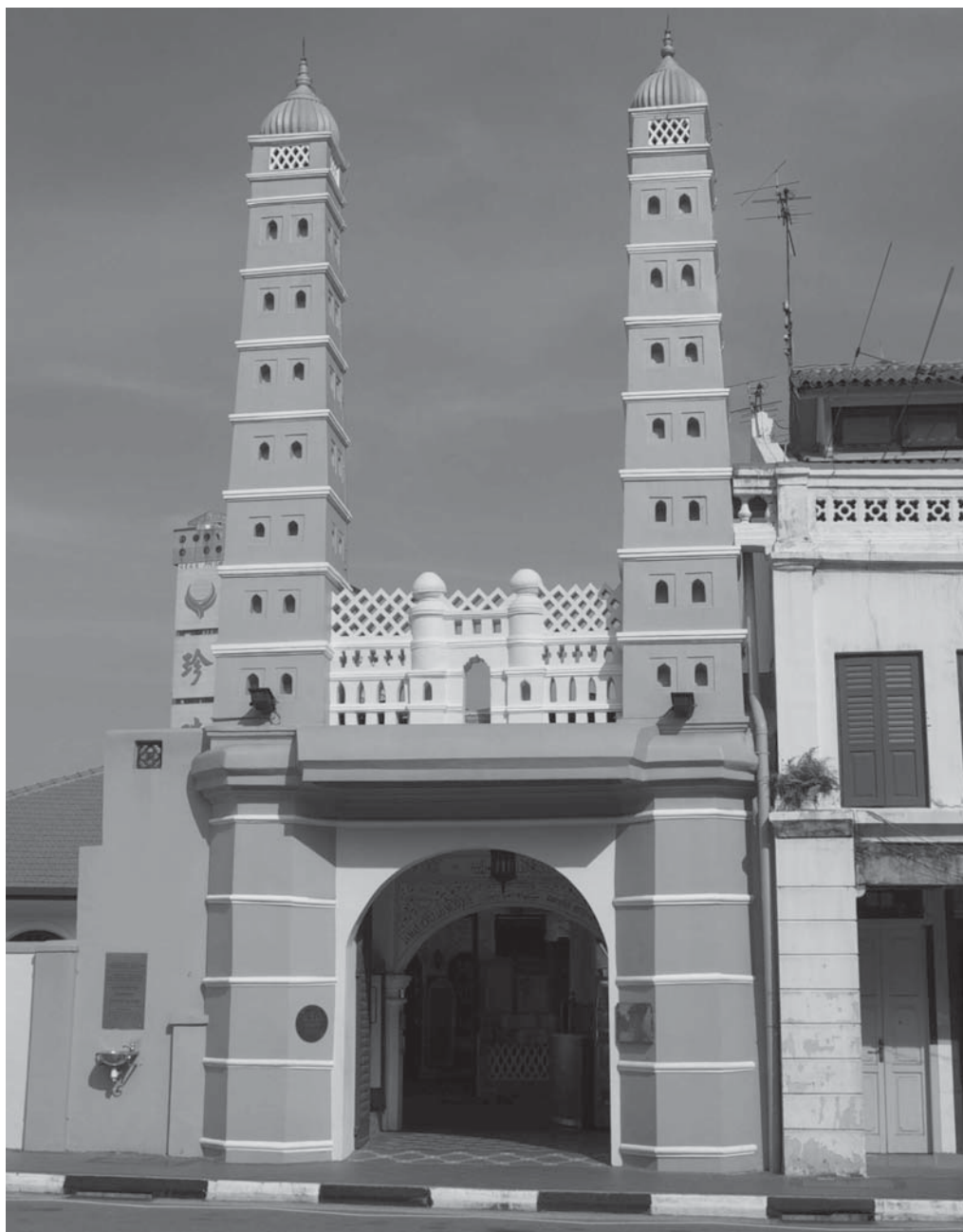
FIGURE 3: The Masjid Jamae (Chulia), South Bridge Road, Singapore, built in 1826.

networks into structures commemorating their favored deities. 21 Some were little more than makeshift shrines, dedicated to local deities, but more permanent structures soon emerged. In 1827, Narayana Pillai, a Tamil building contractor who had