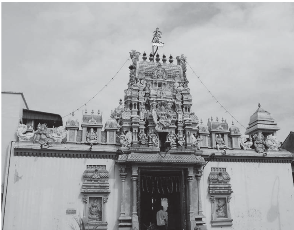
FIGURE 4: The Sri Mariyamman Temple, Queen Street, Penang, built ca. 1833.

arrived in Singapore with the colony's founder, Sir Stamford Raffles, erected the Sri Mariyamman Temple in Singapore, on land granted by the colonial authorities. 22 A similar structure was erected on Queen Street, in Georgetown, by the 1830s. 23