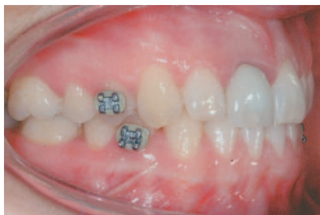
Fig. 1 Brackets positioned on the premolars, with fluoridated elastomers in place.

Each subject had an orthodontic bracket (GAC international, Inc, 185 Oval Drive, Islandia, NY 11749) placed onto a premolar in each quadrant (Figure 1). Standard methods and materials were used to place the bracket, including the use of 30 per cent phosphoric etchant gel to treat the surface of the premolar. They were attached with a non-fluoride leaching composite bonding cement (Rely-a-Bond®, Reliance Ortho Prod. Inc., Itasca, IL, USA). Following bracket placement the subjects were given oral hygiene instruction. All subjects were asked to maintain good oral hygiene for the duration of the study.