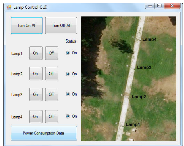
Figure 2. Exemplary GUI of the lighting system.

The processing unit consists of a terminal with a serial UART interface that receives data regarding the state of the lamps provided by a ZigBee device, connected to the UART interface. The terminal is needed for graphical presentation of results. Additionally, knowledge on lamps operation are received along with the lamp address, consequently all faults can be easily identified. The graphical interface permits to visualize the state of the system (Fig. 2) with the state of the lights and the power consumption of every lamp (Power Consumption Data button).