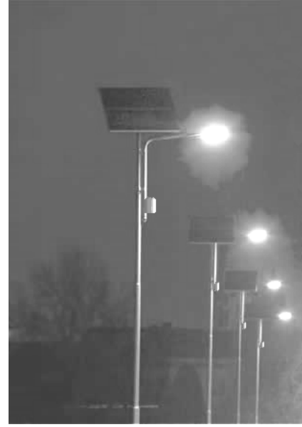
Figure 3. View of the test system.

Power is provided by a battery, recharged from a solar panel throughout the daytime. The capacity of the battery depends on explicit parameters of the application. In the designing part of a photovoltaic system the irradiation curves of the positioning has been studied to work out the inclination and orientation of the surface of solar panels that permit the optimal operation. For the sizing of the panel it's necessary to calculate the annual energy needed to power the lighting. The charge controller manages the processes of the battery charge and power provide. Current generated by photovoltaic panels is handled by the controller to produce an output current for battery charge. The charging method should be conducted consistent with the battery knowledge (capacity, voltage, chemistry, etc.)