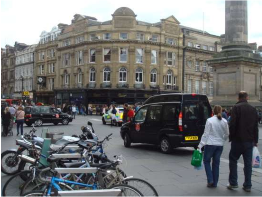
Figure 5: Old Eldon Square, Newcastle