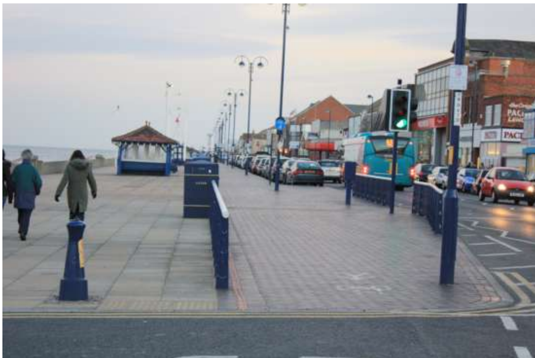
Figure 6: Redcar Esplanade

Stockton High Street is famous for being the widest street in England. It is split into two sections by the presence of the centrally located town hall. The High Street has conservation area status and is surrounded by a mixture of building styles. The space is an important district service hub and there are roads and passageways leading from it. This forms a semi-legible network although visual clutter is a detractor. The space provides the setting for a hive of activity on market days, but the remainder of the time it conveys an unwelcome feeling and is socially barren.