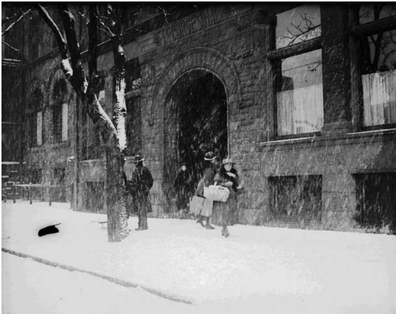
Figure 1. 'Distributing Xmas cheer, St Georges Society', 1922.

crucial in North America: New Zealand's ethnic associations tended to focus on cultural pursuits and sociability rather than charity. 65