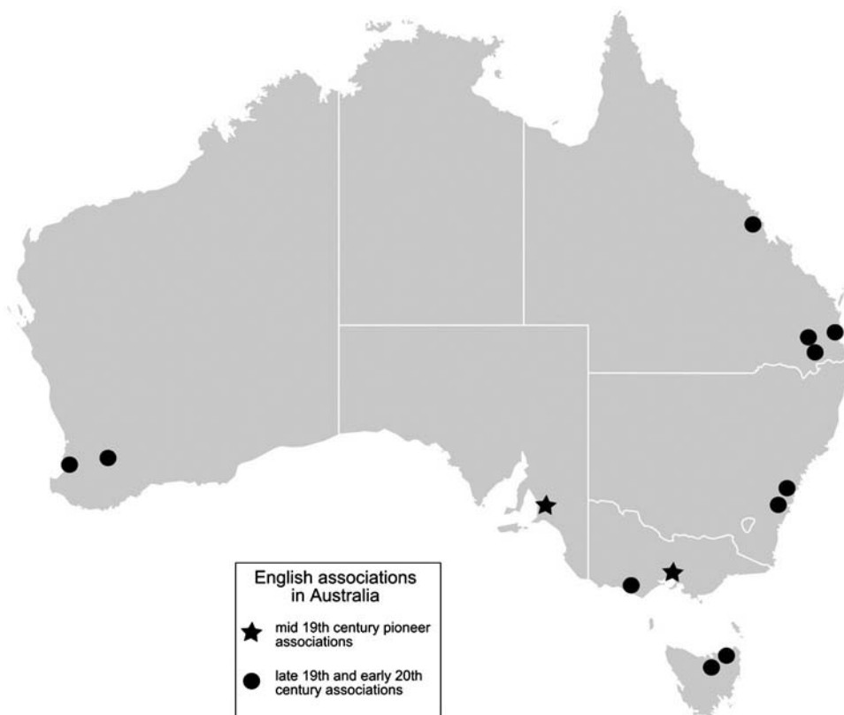
Figure 3. English associations in Australia: geographic trajectories over time.

A similar relationship between the spread of English associations and migration and colonization is also noticeable in Australasia (see Figure 3). The country's first St George's Society was set up in Melbourne in 1847, 83 while Adelaide Englishmen mooted one in early 1845 before finally meeting in 1850. 84 Organized by dedicated Englishmen, the celebration of the national festival at times preceded the official formalization of associational structures, frequently providing a spark for their establishment. 85 By the turn of the century, numerous larger St George's societies could be found across the country, from Kalgoorlie and Perth in Western Australia, to Hurstville and Sydney in New South Wales; from Scottsdale and Launceston in Tasmania, and Warrnambool in Victoria, to Toowoomba and Brisbane in Queensland. 86