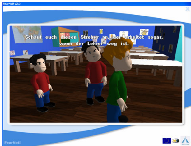
Fig. 1 Screenshot of a bullying episode within FearNot! (German version)

children. In between these episodes, children take over an active part in the ongoing story by counselling the victim regarding coping strategies to handle the repeated bullying. Thus children take over the role of an “invisible friend” to the victimised character and can watch how the story further develops as a result of their advices. As a consequence, the users can affectively engage with what happens and at the same time benefit from the “as-if” mode of the virtual drama, not being involved directly but being able to distance themselves when needed (Hall et al. 2005). Recent pilot studies investigating a one-time use of “FearNot!” could show that the virtual characters are believable and evoke sympathy for the victimised character (Watson et al. 2007; Woods et al. 2003). “FearNot!” consists of male or female bullying episodes (with male episodes including more physical bullying and female episodes more relational bullying), and English and German language versions are available (for more details on the technical framework of “FearNot!” see e.g. Dias and Paiva 2005).