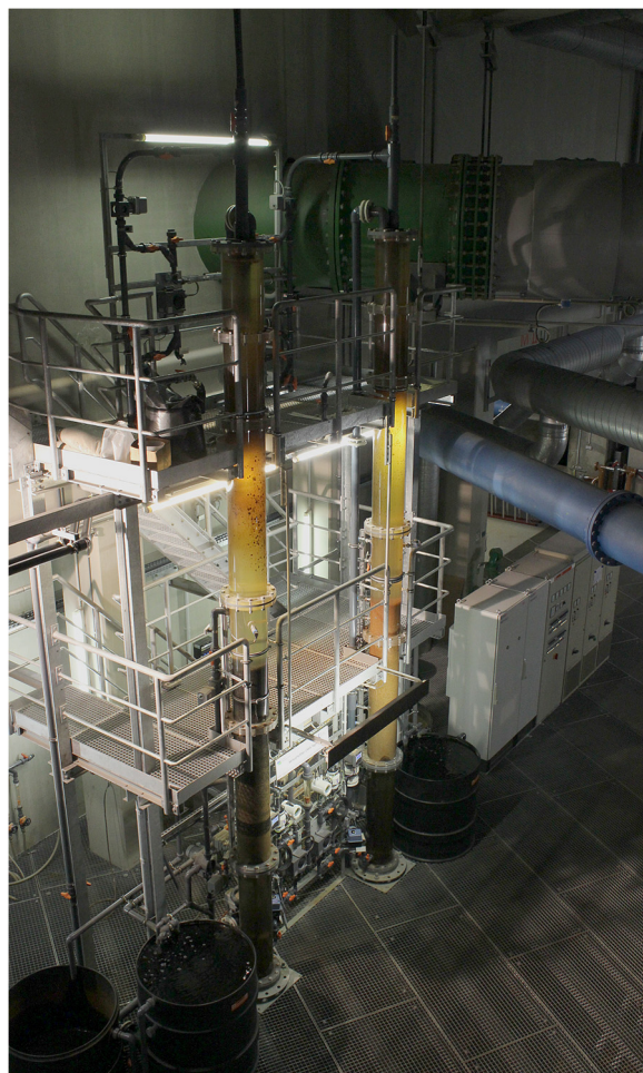
Figure 3 Dual-media rapid filters of the pilot plant in the PEP Tegel in Berlin.

Results show that the filter performance of the GAC filter was equal to the reference representing the setup of the large-scale plant. Phosphorus removal was almost equal to the reference filter resulting in mean concentrations of 16 and 17 \mu\text{g/L} . Likewise, parameters such as dissolved organic carbon (DOC), total suspended solids, UV light absorption at 254 nm wavelength, turbidity and colour values showed no significant difference between the two filters.