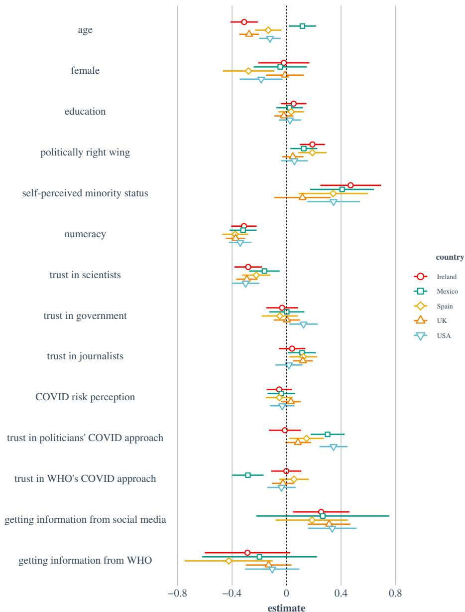
Figure 2. OLS multiple linear regression model for susceptibility to misinformation about COVID-19 by country. Note: results are mean-centred and scaled by 1 s.d. for comparability. Left of the dotted line (i.e. negative values) indicates reduced susceptibility to misinformation.

A number of factors stand out as significant predictors of susceptibility to misinformation across the board. Both higher performance on the numeracy tasks and higher trust in scientists are significantly and consistently associated with lower susceptibility to misinformation about COVID-19 in the pooled model and in all countries surveyed. In addition, being older is also associated with lower susceptibility to misinformation in the pooled model and in all countries, except in Mexico, where the effect is also significant but reversed. 9 Political ideology is significant in three out of five countries; identifying as more right-wing or politically conservative is associated with higher susceptibility to misinformation about COVID-19 in Ireland, Mexico and Spain, but notably not the USA and the UK. Self-identifying as a member of a minority group is also significantly associated with higher susceptibility to misinformation about the virus in all countries except the UK. Higher trust that politicians can effectively tackle the COVID-19 crisis predicts higher susceptibility to misinformation in Mexico, Spain