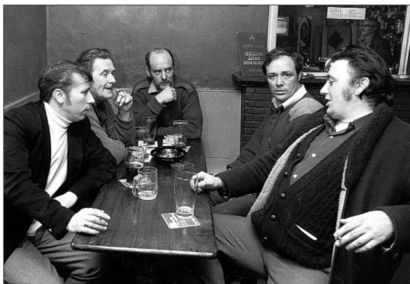
Coal miners in South Wales, enjoying a drink