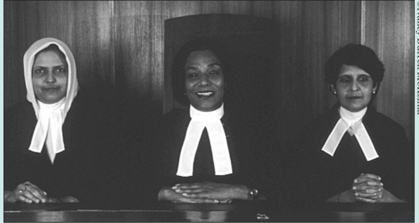
Mauritian women judges

The President of the Republic of Mauritius, Cassam Uteem, formally opened the exhibition in the Fine Arts Building of the Mahatma