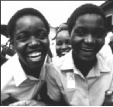
School girls, Zimbabwe

In a recent study carried out in co-educational junior secondary schools in Zimbabwe, male sexual aggression was found to be endemic and institutionalised. Male teachers abused their positions of authority and their duty of care by making sexual advances to girls, confident that they would not be reported or disciplined. The youngest girls entering the school were subjected to the well-developed ritual of older boys propositioning them, in a peer culture which requires boys to boast about their sexual conquests. In both cases, money, gifts or promises of marriage were used to tempt girls into a sexual liaison. If girls refused their advances, they risked being victimised by the teacher in class or beaten up by the boy (sometimes assisted by his friends). Other ways in which boys sought affirmation of male dominance in and around the school was by touching girls provocatively, shouting obscenities at them and at times assaulting them for no apparent reason.