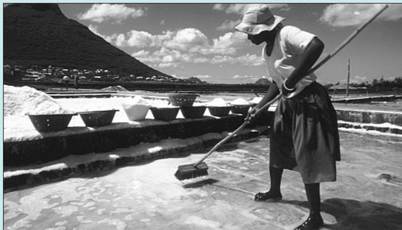
Mauritian woman working in the Salt Pans