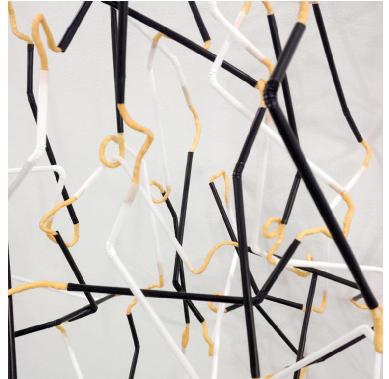
Figure 25 49