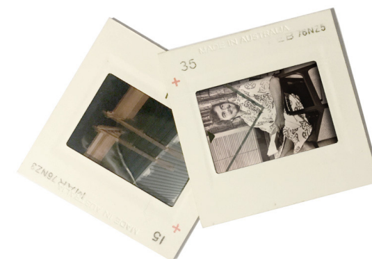
Figure 2 10

Perceptions of things are not inherent to the material object itself but are defined by each spectator’s existing conceptions and their own history with that object. If someone’s past experience with an object is different to another spectator then each will understand it in different ways. For example, when held up to the light, the photographic slides illustrated below (Fig 2) invokes two pasts: the past of the person who initially took the slide but also the past of the person who looks at the slide. We see the past of the image within in the slide, but the material itself also has a particular utilitarian association with the past that we retrieve from our memory when we look at it. We understand how the device of the slide functions, because we know that the slide holds an image when we hold it up to the light. We know how to use it because we have seen it or used it before in past encounters.