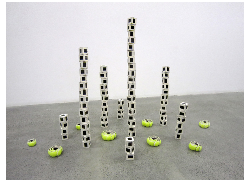
Figure 10 27

Verwoert also talks about the idea of “deriving new structures and qualities from the interaction of elements in a complex system.” Through the clever combining of multiple objects, potentials become possibilities and completely new unexpected combinations and patterns emerge. For example, in my work Autonomous Things (Fig 10) six individual photographic slides were combined to create a cube. This process was repeated many times and the cubes were stacked on top of each other. In multiples and no longer considered as individual ‘inert objects’ they took on a rhythm and life of their own as an aggregate. This simple reconfiguration utilised a hidden potential and also opened up the prospect of new perceptions and possible outcomes. Just as water can reconfigure to become ice, the photographic slides were reconfigured to change the way they structurally behaved without disrupting their recognisability. By exploring new possibilities and characteristics of recognisable things through multiples, our conception and understanding of the objects begins to change. Associations with the objects’ individual past function become less significant as the multiple configuration encourages the viewer to see them as art materials, combining to make a whole artwork.