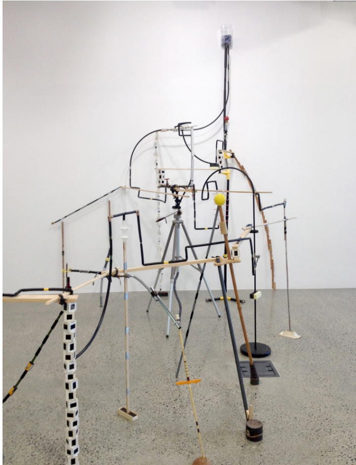
Figure 28 52