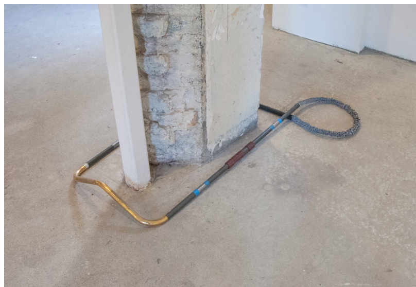
Figure 20 42