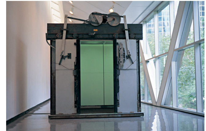
Figure 1 6

Gabriel Orozco's work Elevator (Fig 1) was salvaged from an old building and was recontextualised in a gallery as an artwork, and yet habits of thought and existing perceptions linked to its function persisted. When viewers entered the confined box they responded with immediate sensations of movement. Usually not subject to consideration when functioning in everyday life, Orozco's elevator, out-of-order and in a gallery, activated these routine responses. Orozco noted that when an elevator "goes up and down you feel it in your stomach, so when you go into this elevator you remember that feeling..." 7 The concept of 'the elevator' was strong enough to produce a physical response from users, even when divorced from its context and function by being presented in a gallery as an artwork. This shows that conventional perceptions of things are hard to shift, even when an object is re-contextualised and repurposed.