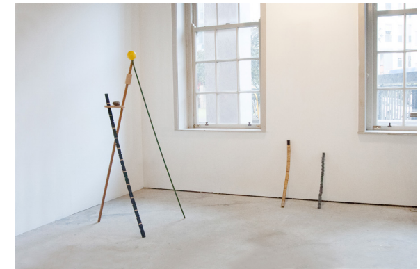
Figure 15 34

O'Sullivan states: "The Web remains a space of creativity, invention and expression. It allows for a certain amount of individual freedom, or simply self-organisation (open source software developments would be a case in point). It is in this sense that the Web is paradigmatically a rhizome." 33 As with the rhizome, the Internet is also an example of a network that provides conventional images and ideas the opportunity to connect or be considered together in new ways. The Internet creates the possibility for objects or images to be easily repositioned and reconsidered as aesthetic art materials with new potentials. Art materials like glue and paint are becoming problematic my art practice, because they fix things in place and no longer allow for movement. Once something appears finished or complete it becomes static and likely to be seen in only one or a limited number of ways and the object or artwork is unlikely to move forward with vitality and be reinterpreted in new ways. For example, In my work Connect Five , the artwork was made without any glue. The structure holds itself together and stands freely on its own. These items continue to have the potential to be detached and become a part of completely new ideas with new possibilities, much like images can through rhizomatic networks over the internet.