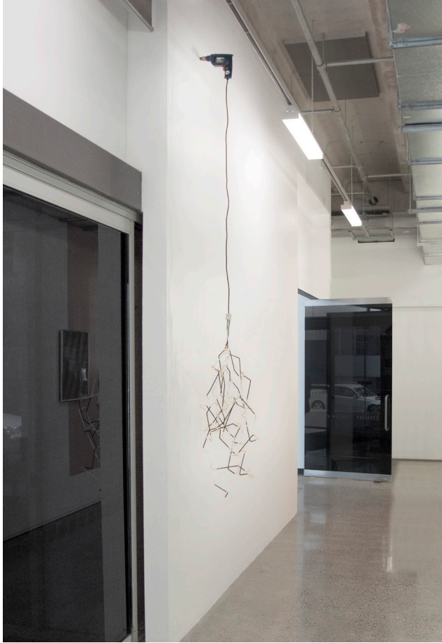
Figure 24 48