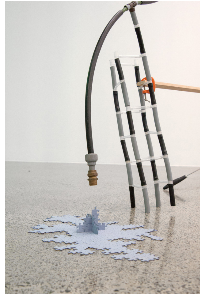
Figure 27 51