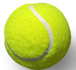
Figure 18 39

In the emergence of new possibilities, potential and latency must be sensed when looking for objects that could become art materials. However they are fundamentally different and are sensed at different stages the process of my art making. Potential is a capacity that we sense. Its future and outcome is uncertain and inconceivable. When we sense something that has potential our sub-conscious picks up a variety of small signs that tell us that this thing is of interest to us. We cannot quite understand this feeling of potential but it is there. The longer you spend time with the objects the more potential you may uncover. Latency, unlike potential requires time and the right conditions in order to emerge. It is a term used in scientific studies to describe when something is dormant but eventually will happen at some point. For example, water that is being heated by a flame and is about to boil but hasn’t yet. For example, I encountered a yellow tennis ball sitting in a patch of tall grass. As I picked it up and looked at it I could sense a strong potential quality for the object. I couldn’t pinpoint exactly what it was that attracted me to it, so I took it back to my studio to investigate further. As I examined and thought about this object, I started to identify certain attributes and qualities could explain this initial intuition of potential.