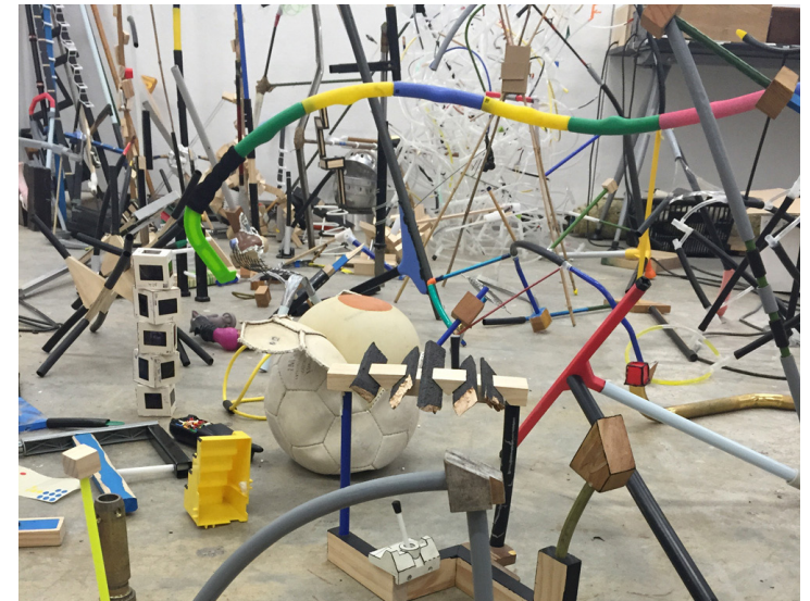
Figure 7 20