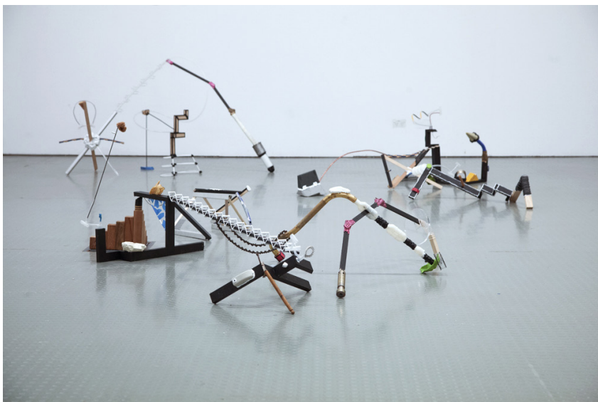
Figure 5 14