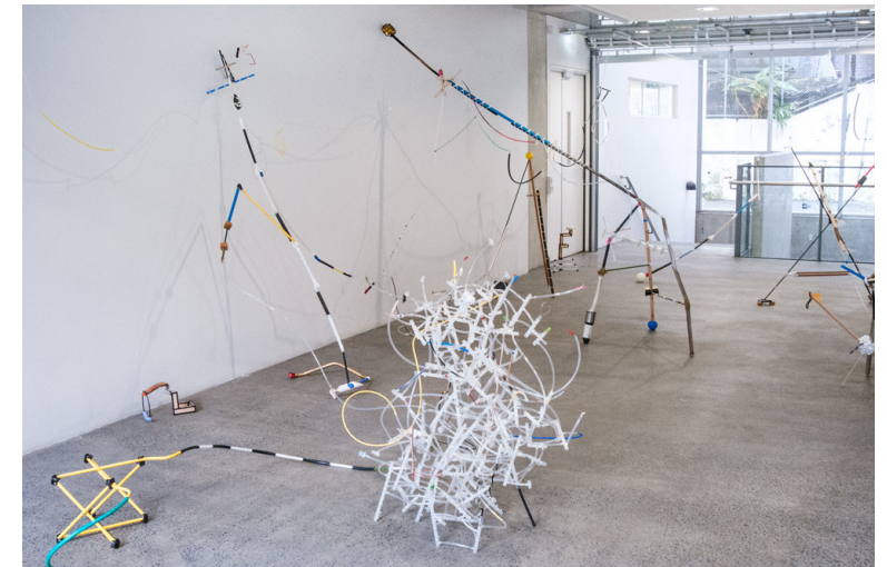
Figure 9 23