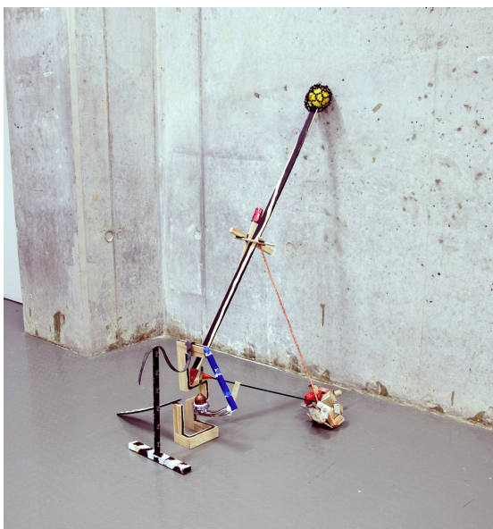
Figure 6 15