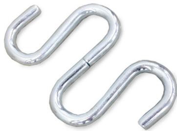
Figure 0, SS, two S-hooks welded together