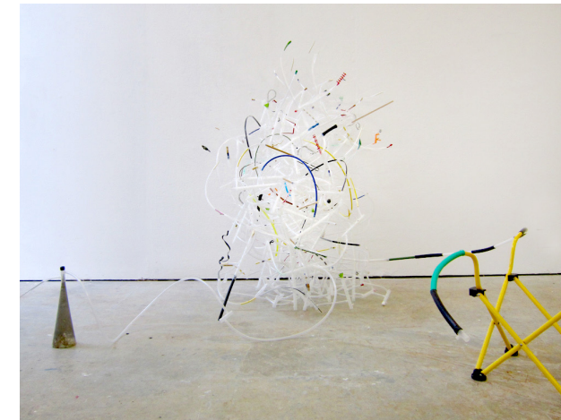
Figure 12 30