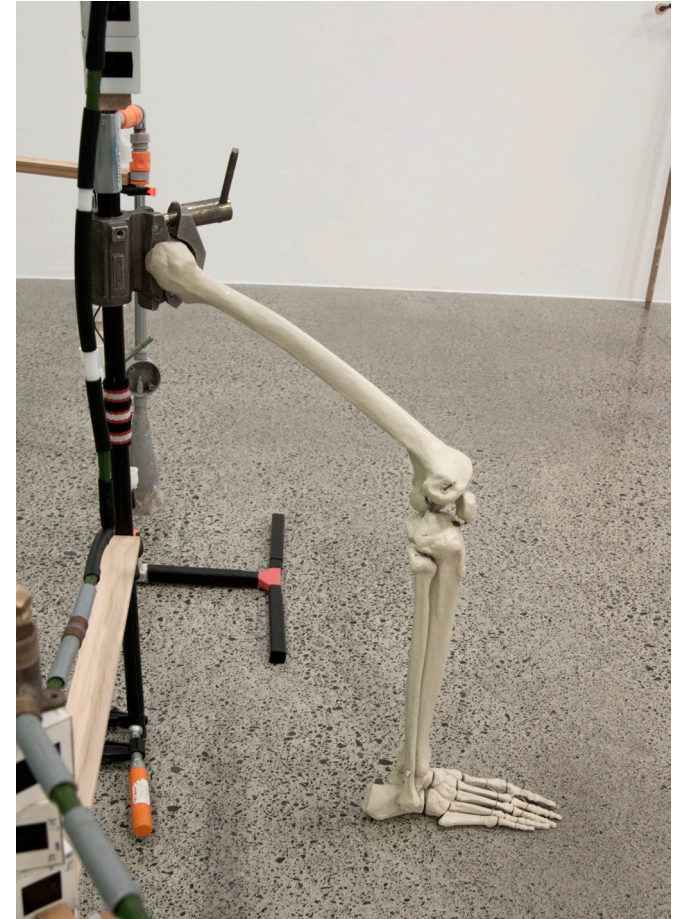
Figure 29 53