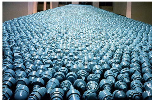
Figure 14 32