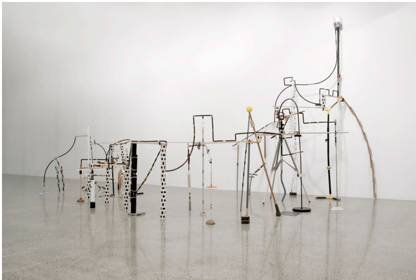
Figure 26 50