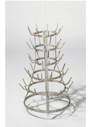
Figure 3 11

For example, the signs that are attached to the object illustrated in Figure 3 hold no utilitarian reference for me, and I see it as an aesthetic object.