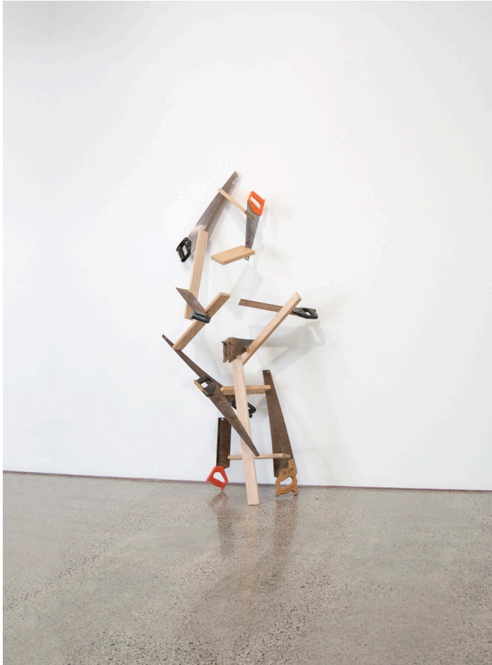
Figure 22 46