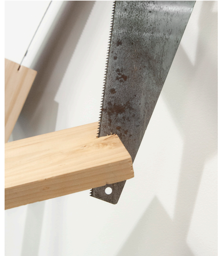
Figure 23 47