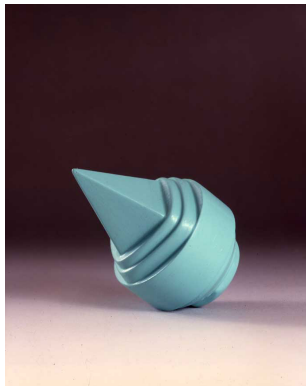
Figure 13 31

Another example of a system that connects different things together to bring about new thoughts and ideas is the internet. This network of information and ideas works similarly to a rhizome as it has the ability to connect things together which would normally never be connected.