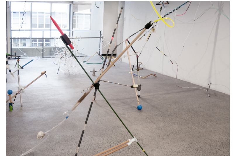
Figure 8 22