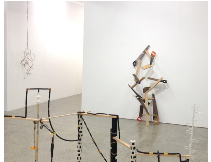
Figure 21 45

The exhibition was comprised of three structures that were positioned in different areas of St Paul Street Gallery. The installation was determined by the individual material capabilities of each object used and by the nature of the gallery space. In this way, the works revealed themselves during their construction. The walls were used to support the structure, however no hidden glues or hooks were used to assist unless made obvious and incorporated as a material in the work.