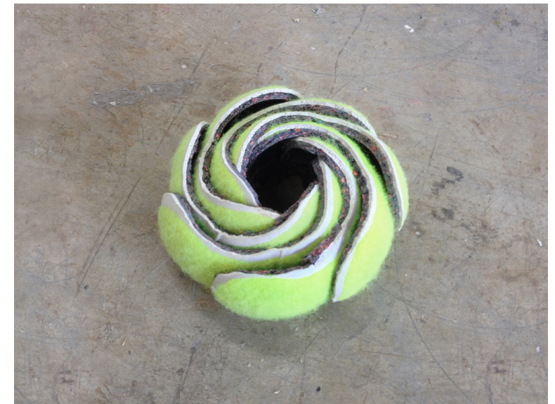
Figure 19 41