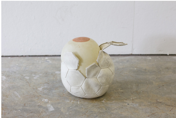
Figure 17 38

he argues that “...our typical ways of being in the world are challenged, our systems of knowledge disrupted. We are forced through thought. The encounter then operates as a rupture in our habitual modes of being and thus in our habitual subjectivities. It produces a cut, a crack.” 37 For example, the work Red Spotted Ball Bladder (Fig 17) was an object found at a park that through my encounter with it, became an art object. For an unknown reason the stitching that holds the ball together had been split open, exposing the rubber bladder inside. There was something strange and confrontational about the positioning of the red dot that was on the rubber bladder. As Duchamp had done with the Bottle Rack when exhibiting this work, I had taken it from one site and transplanted into another site, and the contextual change reorientated the viewer’s response to the object. Through the agency of this simple translocation the object became something more than what it had been.