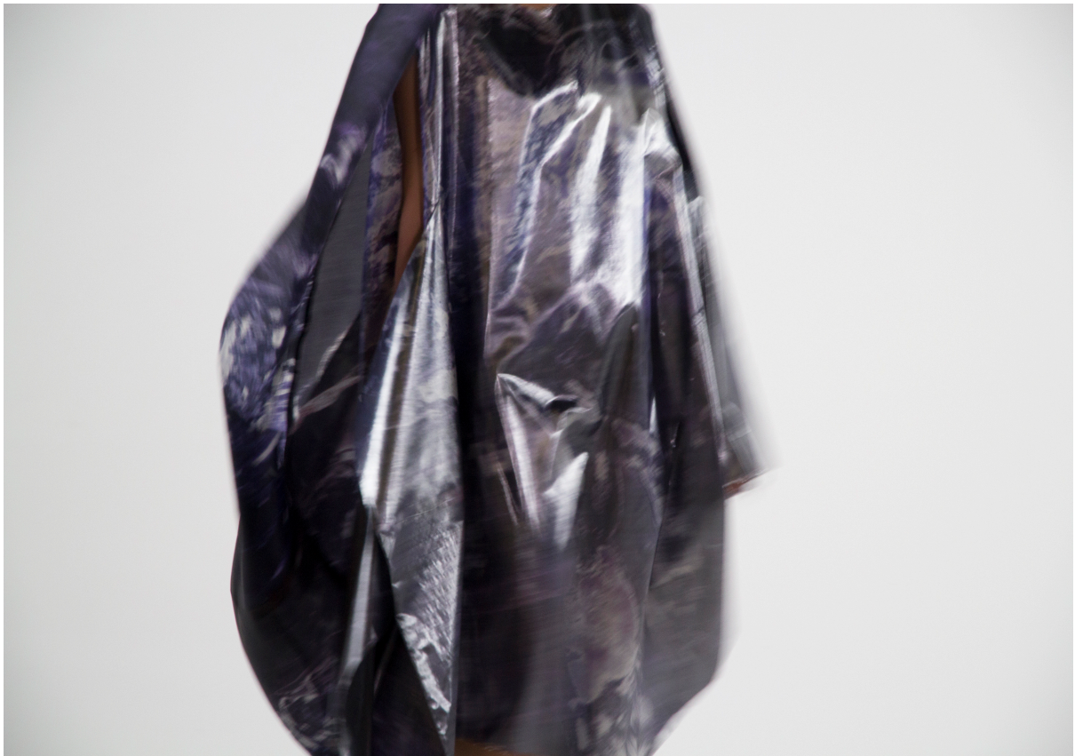
Figure 4. Armando Chant, 2014.