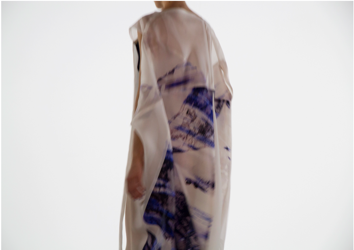
Figure 3. Armando Chant, 2014.