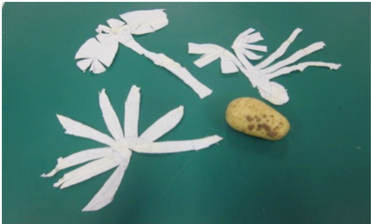
Figure 2: Three different flat patterns to fit the adjacent potato, all have the same overall silhouette but variable 'seam' lines.

The first exercise involved the student participants working independently to securely and closely wrap a potato in paper. They were asked to use as little paper as possible. Students drew (seam) lines on the covered potato, notched and cut along the marked lines to create a flat pattern. The process was repeated three times, and on each occasion participants had to vary the seam lines and create a different flat paper pattern for the same silhouette (Figure 2). A group discussion on how the positioning of the cut lines had informed the flat pattern shape followed.