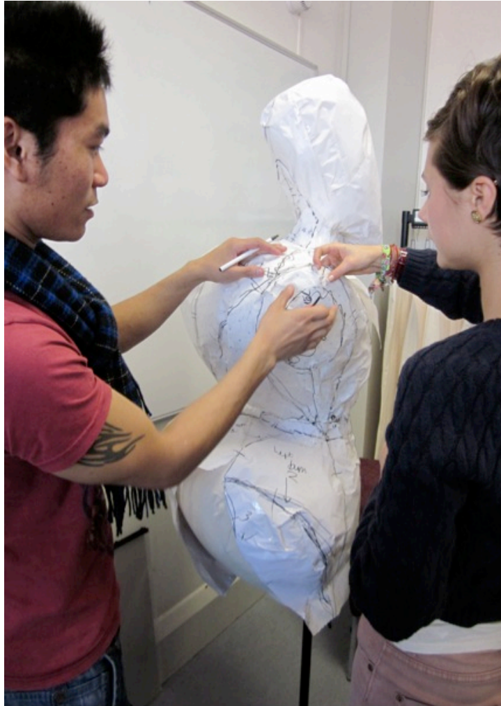
Figure 3: Workshop 01 – Encounter, first year students discussing seam positioning

helped to prepare the students for this process with a more complex shape. This began the process of moving away from the preconceived ideas of human form and established seam and dart positions. For example, a student remarked later on in the process when working with Alien Body 04, “when is a bust dart not a bust dart, when it’s a big nose!”