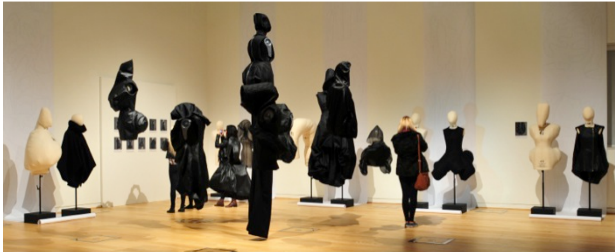
Figure 4: Alien Body Exhibition.

Eighteen of the final garments were selected to exhibit at the Sheffield Institute of Arts Gallery within SHU (Figure 4). The reasoning for the selection focused on creative and original outcomes, three garments from each of the six Alien Mannequins to create a balance of form and communication of the complete range of fabrics used.