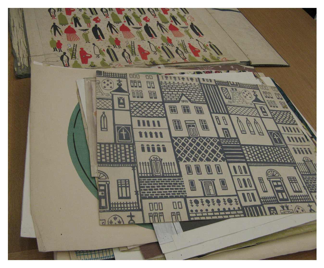
Figure 3. Sylvia Chalmers Portfolio. Archives and Collections Centre, Mackintosh Building, The Glasgow School of Art.

Mackintosh. Held by the University of Glasgow, many of Mackintosh's textile designs were drawings on paper and never produced. The aim of the project was to explore ways in which the original sketches could be reinterpreted to create new textile designs. Using high quality scans held by the Hunterian Art Gallery, the project team explored the colour matching process. They then worked individually to create new designs from the nineteen original selected textile design sketches. The project resulted in an exhibition (Campbell, Shaw, & Begg, 2008) of newly created printed textile lengths and original archive sketches, an exhibition catalogue (Campbell, 2008), a series of talks and school workshops. The resulting collection of fabrics is on permanent display at the Mackintosh Interpretation Centres, France.