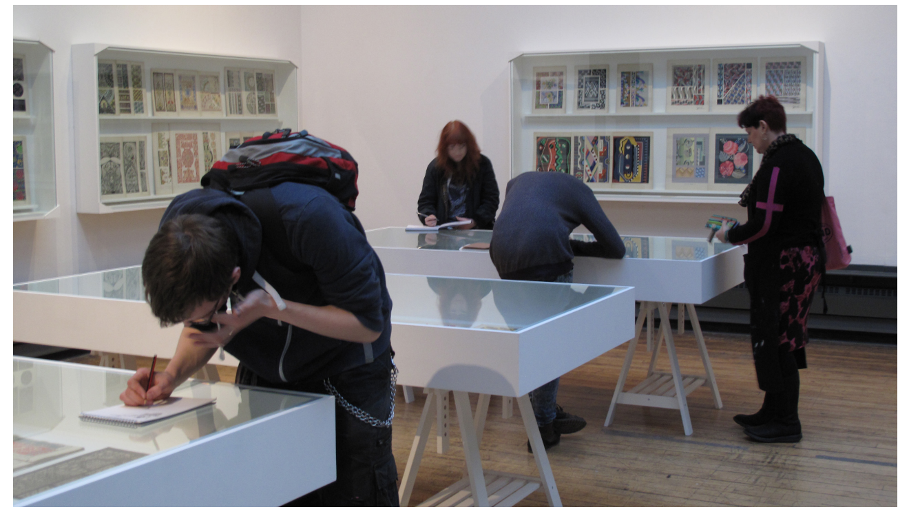
Figure 6. Interwoven Connections continuing education gallery talk and workshop. Mackintosh Museum, The Glasgow School of Art, 21 November 2013.