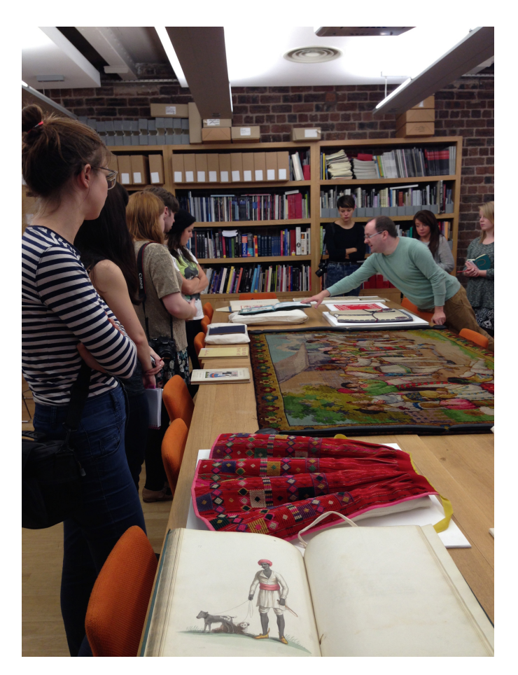
Figure 2. Archives and Library Special Collections undergraduate induction. Archives and Collections Centre, Mackintosh Building, The Glasgow School of Art, 27 September 2013.