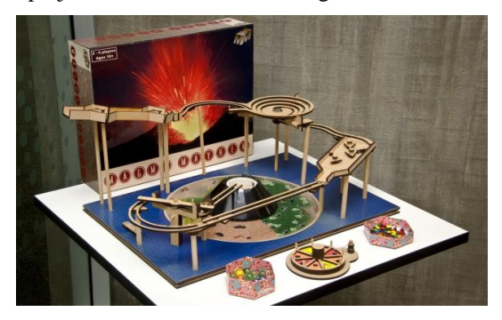
Fig. 2. Sample finished project

Upon completion of the first stage of the project, students are encouraged to let their imaginations run wild in the design and implementation of their chain reaction game, applying what they have learned about how mechanical systems work in practice. The outcomes of the project are predictably variable, however the majority of students find motivation through the ability to define and create their own game scenario. A typical project outcome is shown in Fig. 2.