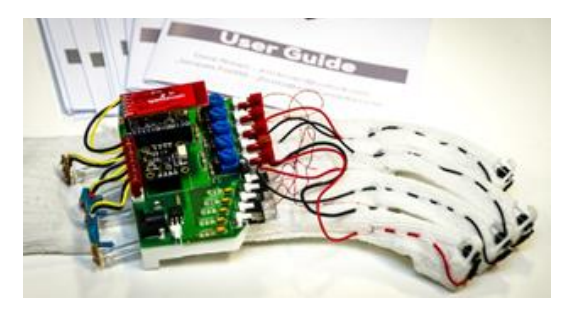
Fig. 5. The finished haptic glove

The combination of guided discovery based with the student-centric project produced a truly inquiry based learning process. By not constraining the project in any way, the students tried things out, prototyped solutions and came up with creative solutions to difficult problems. There were of course mistakes and failures along the way, but these should also be considered positive learning experiences. For example, the first prototype of the glove used an Arduino Uno microprocessor with the circuitry assembled using a solderless breadboard. This of course resulted in a bulky solution. The students decided to develop a custom printed circuit board (PCB) and set out to learn how to achieve this. In this process, the students designed their PCB around the footprint of the surface mounted chips based on the manufacturer's datasheet. However, they had neglected to consider the orientation of the chips which resulted in the pins not matching the PCB circuit – the student though the datasheet was looking top down, but the datasheet had the pinout represented bottom-up. This resulted in a painstaking soldering endeavor to correct the mistake, in this case a mistake the student will not make again. It is our belief that mistakes are inevitable, and had the student not made the mistake in the relatively safe learning environment that that it could have occurred later in their career when the implications of such a mistake could have been more costly.