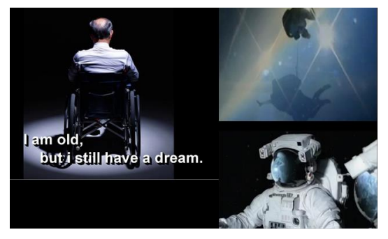
Fig. 3. Virtual reality experience visual board

solution using participatory approaches. The project also assisted students to engage with broader contextual and social issues in creating innovative concepts. Students were encouraged to use visual storyboarding and digital storytelling of the solution to the users. In this project problem based learning had an effective outcome for most of the students. It helped them to come close and align their thinking with the reality. Examples of visual storytelling are shown in Fig. 3 and Fig. 4.