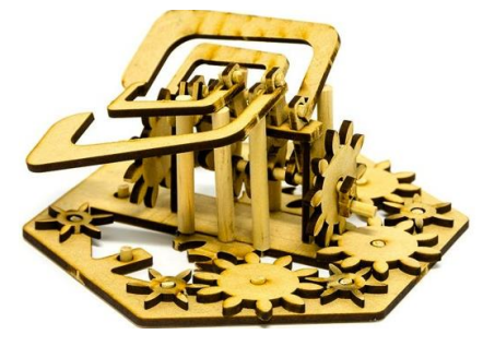
Fig. 1. Sample automata

to promote risk taking as well as achieve a practical appreciation of principles of physics and mechanics. The project is structured in two parts, the first being the creation of a simple mechanical automata that is designed using CAD software and then manufactured by utilising the laser cutters in the Faculty fabrication facility. A typical mechanical automata is shown in Fig. 1.