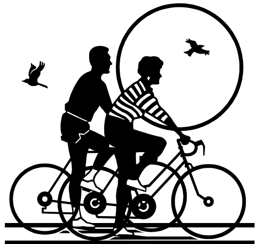
Figure 2: The user experience of bicycling

The focus is still on the customer, but the emphasis is shifting to providing customer value by giving a total "user experience". The user experience can best be illustrated by a metaphor of bicycling. What is important to the customer (the biker) and valued by them is the activity of bicycling , for which the bicycle (the product) is the means to the end. By focusing attention on the activity, rather than on the product, the bicycle manufacturer will also have the chance of identifying new opportunities for adding value and new products, e.g. specialist clothing, protective equipment, child seats, and trailers.