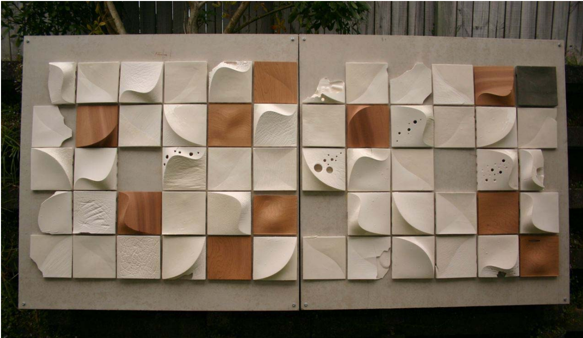
Figure 3. S. Reay, 2011