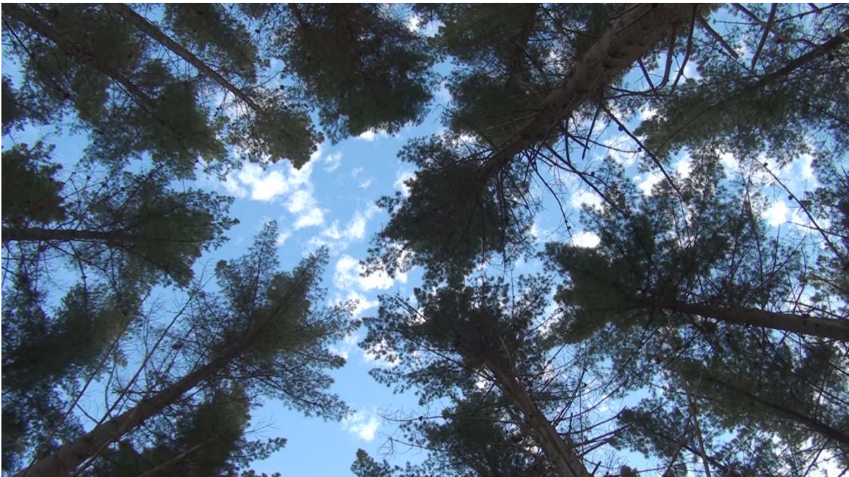
Figure 2. A. Denton, S. Reay, 2012