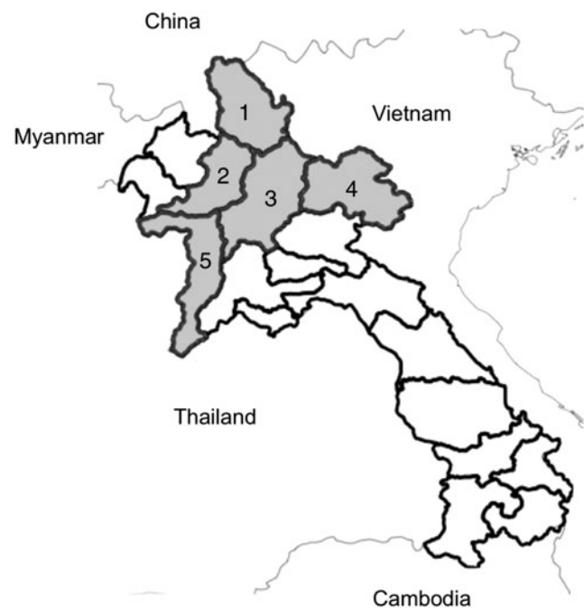
FIG. 1. Study sites in northern Laos PDR (1, Phongsaly province; 2, Oudomxay province; 3, Luangprabang province; 4, Huaphan province; 5, Xayabuly province).

Diagnostic cutoffs for the CHECKIT* Q-Fever Antibody Test Kit, Bovine Brucellosis Ab ELISA, and Bovine Tuberculosis Ab ELISA were determined using the manufacturer's recommended controls and calculations. The Leptospira IgM ELISA (BioNote) is an assay in development, and the manufacturer did not suggest a fixed diagnostic cutoff. The