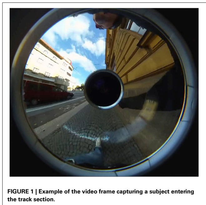
FIGURE 1 | Example of the video frame capturing a subject entering the track section.

The selected musical pieces were used in Music B at the original tempo. Music A was 8% slower, music C was 8% faster.