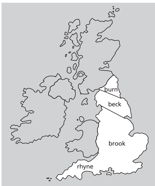
Figure 2 Words for ‘stream’

Once again, a similar distribution was found from the Leeds respondents (Figure 2). With the exception of one respondent, describing herself as coming from ‘north west London’ (who gave her word as wadi , presumably reflecting a South Asian association), the student respondents supplied only beck and brook , congruent with their location. The alumni day respondents added burn , from two respondents further north, and rhine , from two respondents from Somerset. The methodology used with the students did not discourage