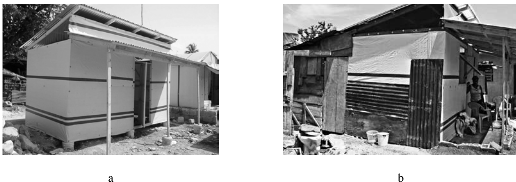
Figure 6 - Units modifications: (a) temporary housing unit before being used and (b) after the user modifies it.

and Altum, 2009). Likewise, in post-disaster scenarios the house is often a family workspace (Kellett and Tipple, 2000), and those modifications are essential to facilitate the creation of appropriate spaces for that. Using local materials and building technologies allow people to introduce modifications, which makes maintenance easier and more economical, in order to improve the long-term possibilities of the constructions. Despite the criticism to the new modern ways of production used to build temporary accommodation buildings, and the emphasis on the usage of local resources, it does not mean that innovation has no space in the development of temporary solutions. Properly used, that is to say culturally and locally integrated, innovation and technology may contribute in a useful manner to improve temporary accommodation solutions (Shaw, 2009; Davidson et al, 2008; Garofalo and Hill, 2008). Therefore, the design should balance a combination of technological and local ways of construction and materials (Félix et al, 2013c).