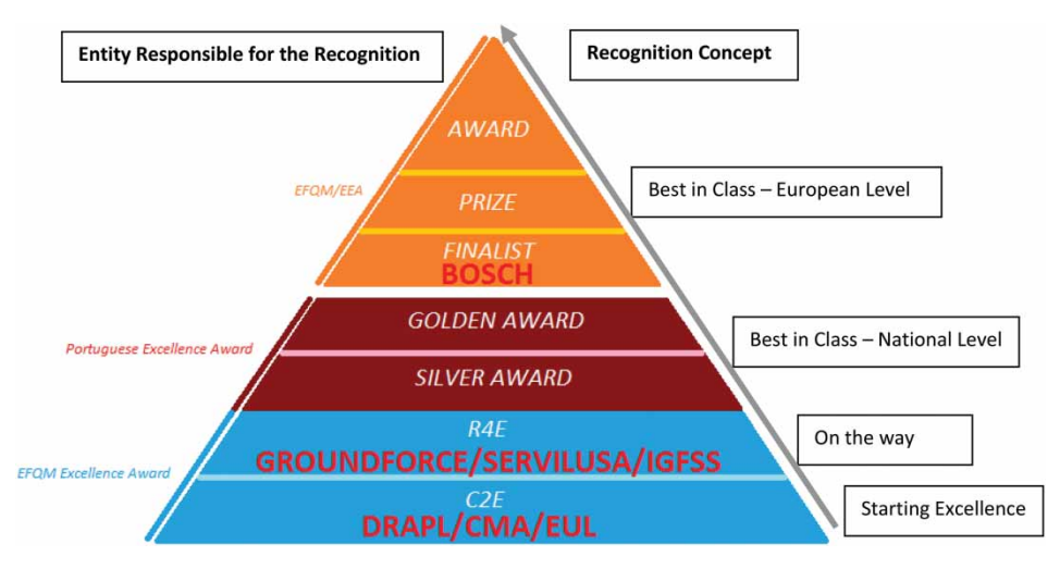
Figure 1. Path to excellence.

The focus of Maturity Models demands the assessment of the entire organisation with respect to its performance of key systems in order to create a high-performance organisation (Van Aken, Letens, Coleman, Farris, & Van Goubergen, 2005). They are based on the principle that people, organisations, functional areas, processes, etc., progress through a process of development or growth to a more mature and advanced stage (Rocha & Vasconcelos, 2004).