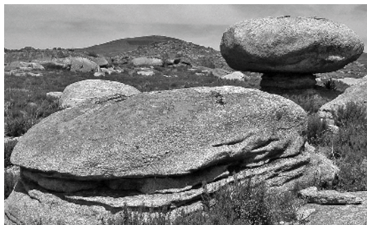
Fig. 2: Cheira da Noiva geomorphosite (L13), an example of a granite area with significant «aesthetic value» Geomorphologisches Geotop Cheira da Noiva (L13), ein Beispiel einer Granit-Region mit signifikantem Ästhetischen Wert Géomorphosite Cheira da Noiva (L13), un exemple de site granitique ayant une valeur esthétique significative