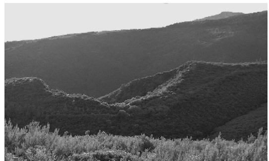
Fig. 3: Boca da Caborca geomorphosite (L07), a landform with «cultural value» as a result of the Roman gold mining Geomorphologisches Geotop Boca da Caborca (L07), eine Landschaftsform mit hohem Kulturellen Wert aufgrund des Goldabbaus zur Zeit der Römer Géomorphosite Boca da Caborca (L07), une forme du relief à haute valeur culturelle en raison de la présence de l'exploitation d'une mine d'or à l'époque romaine