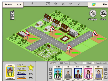
Figure 3: SpITKom Browser-Game (Draft Version)