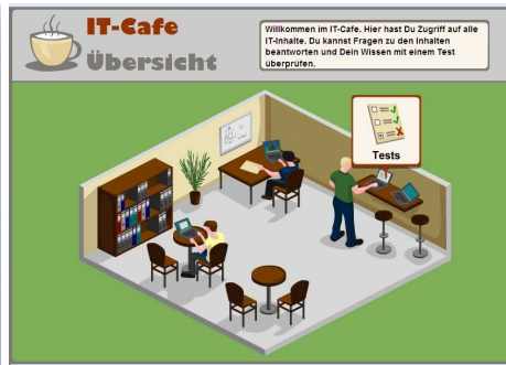
Figure 4: IT-Café (Draft Version)

Technically, the SpITKom system is partly based on the OICS platform. The SpITKom architecture comprises two main components: the front-end community platform and the OICS learning service component. In addition, the open source QTIEngine 3 is integrated to visualize and evaluate assessments. The community platform is based on the LifeRay open source community server. It contains the flash-based game front-end (fig. 3) and the CCT (Competency Checker and Trainer) which is realized through the IT-Café (fig. 4).