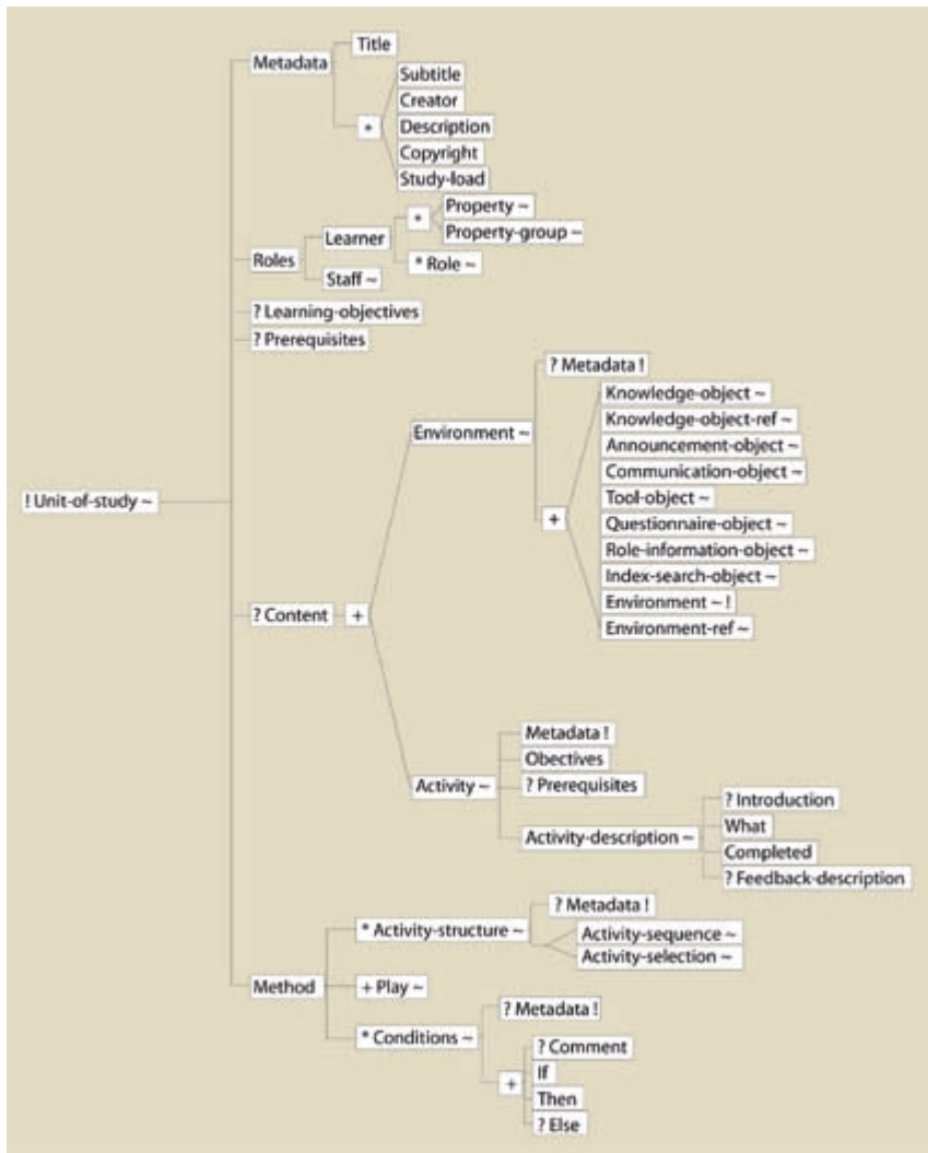
Figure 3. EML displayed in an XML tree structure

Working this structure out in XML yields, at a primary level, the structure in figure 3.