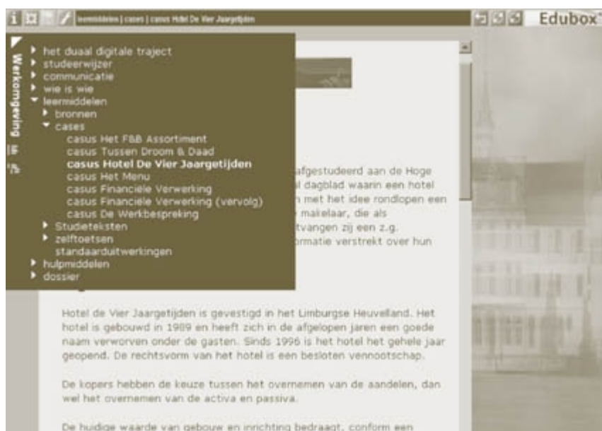
Figure 7. Work environment in an activity. Source: Basic Management course at the Maastricht School of Hotel Management.

The next figure (7), finally, gives an impression of the work environment that is used in a specific activity. This environment can differ per activity.