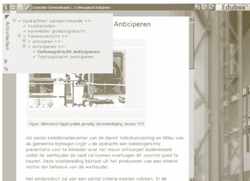
Figure 6. A unit of study as interpreted by Edubox, seen from the role of the student. Source: unit of study for Local Administration degree programme (Gemeentekunde), Open University of the Netherlands .

The next figure (7), finally, gives an impression of the work environment that is used in a specific activity. This environment can differ per activity.