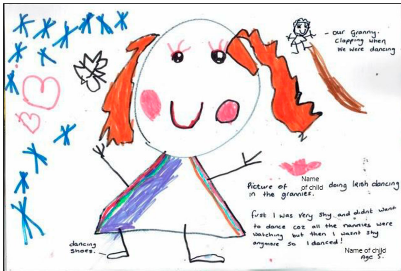
Figure 2. Example of 'Draw and Talk' strategy.

... our granny clapping when we were dancing ... first I was shy and didn't want to dance coz all the nannies were watching but then I wasn't shy anymore, so I danced ... (Child A, aged 5).