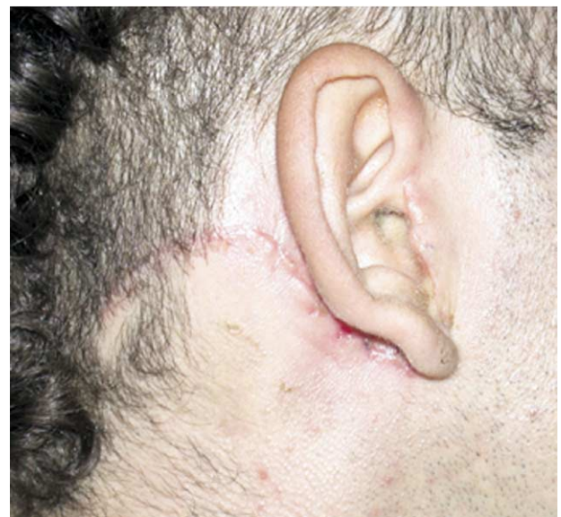
FIGURE 4. Postoperative results.

Buono et al. The Stylohyoid Process in Eagle's Syndrome. J Oral Maxillofac Surg 2005.