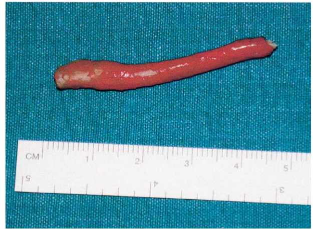
FIGURE 3. Surgically excised segment.

Buono et al. The Stylohyoid Process in Eagle's Syndrome. J Oral Maxillofac Surg 2005.