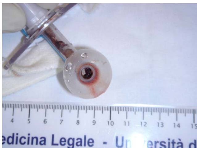
Figure 1 Cannula obstruction because of the blood clot.

Tube obstruction by a blood clot forming a one-way valve is a rare but often fatal complication. Airway obstruction is described in the literature 2-7 together with management procedures to remove clots. 6,7 A ball-valve clot obstructing the upper respiratory tract is a life-threatening emergency. Prompt intervention is necessary to restore respiration.