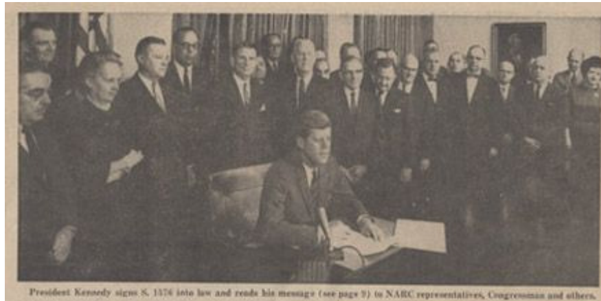
President Kennedy signs S. 1474 into law and reads his message (see page 9) to NARC representatives, Congressmen and others.