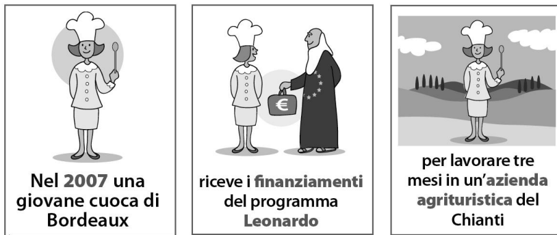
Fig. 2 – Three example pages of an MMS message [Screenshot 1: In 2007 a young cook from Bordeaux, Screenshot 2: received Leonardo programme funding; Screenshot 3: to work for three months in an agritourism company in the Chianti region]