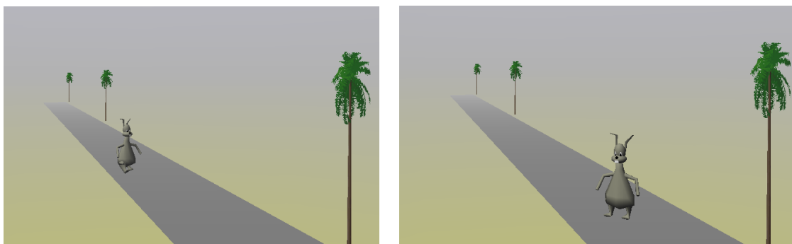
Figure 2. Example snapshots of the movie clips shown to the participants. In all clips the rabbit was portrayed as going towards the viewer along a globally straight path (the snapshot on the left). In clip 4 the rabbit made six loops while going down the path (the snapshot on the right shows the rabbit making its final loop). The background was slightly larger in the real clips.

For present purposes the responses of all participants in relation to only four clips were analyzed: all these clips portrayed the rabbit going towards the viewer along a globally straight path (see figure 2), with clip 1 containing multiple non-smooth curvatures (a zigzag-like path), clip 2 containing multiple smooth curvatures (a slalom-like path), clip 3 containing one loop, and clip 4 containing six loops.