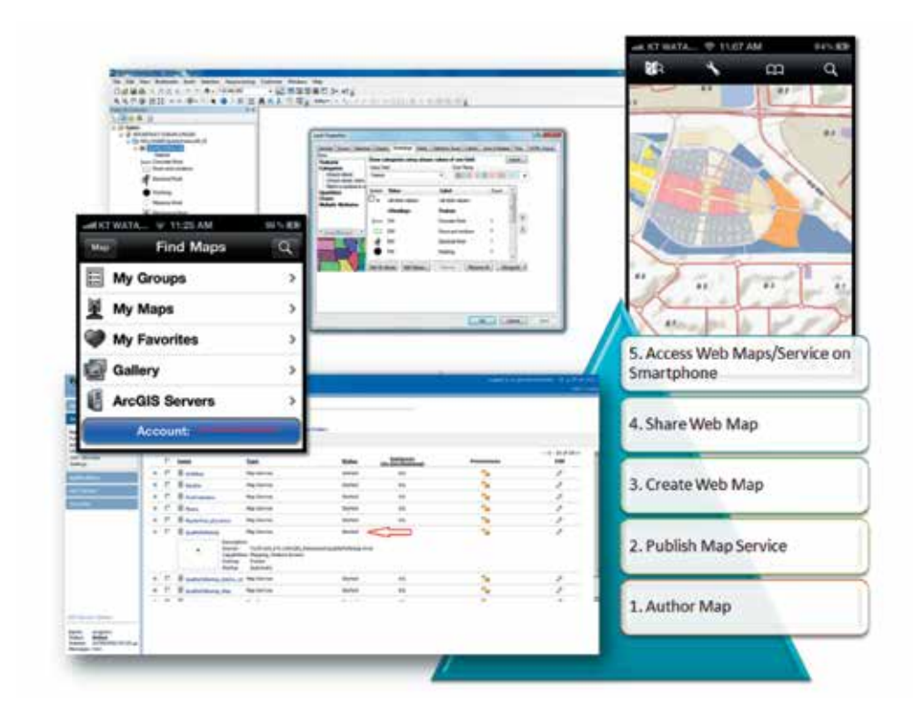
Fig. 4: Authoring and publishing featured contents.

The background preparations for the Mobile GIS Application for Quality Managers and Surveyors involve modeling the GIS data to meets the requirements of the task performed by the managers and surveyors. Appropriate GIS data is used to Author Map that shall server for publishing map resources. While publishing the resources "feature access" is enables as capability of the published features service. The next step is to add the feature service as content of your ArcGIS Online using global account and create a Web map. Once the Web map is created it is shared to group for surveyors and managers. The managers and surveyors should have an account on ArcGIS Online or they can create a new one and add them self to the group in order to access the featured maps content.