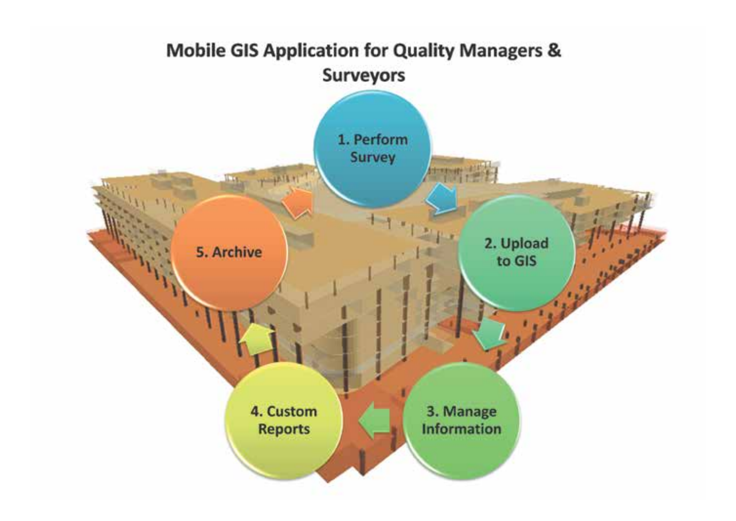
Fig. 1: Workflow for high-level quality survey using mobile GIS.

This entire process is performed though a defined workflow and the information collected during the survey is stored in a central database server. Managers and other coworkers can view this information while the surveyor is still on the field or back on his way to office. The managers can use ArcGIS online, ArcGIS Desktop for viewing the observations made by individual surveyor. The steps involved in the entire process are given below: