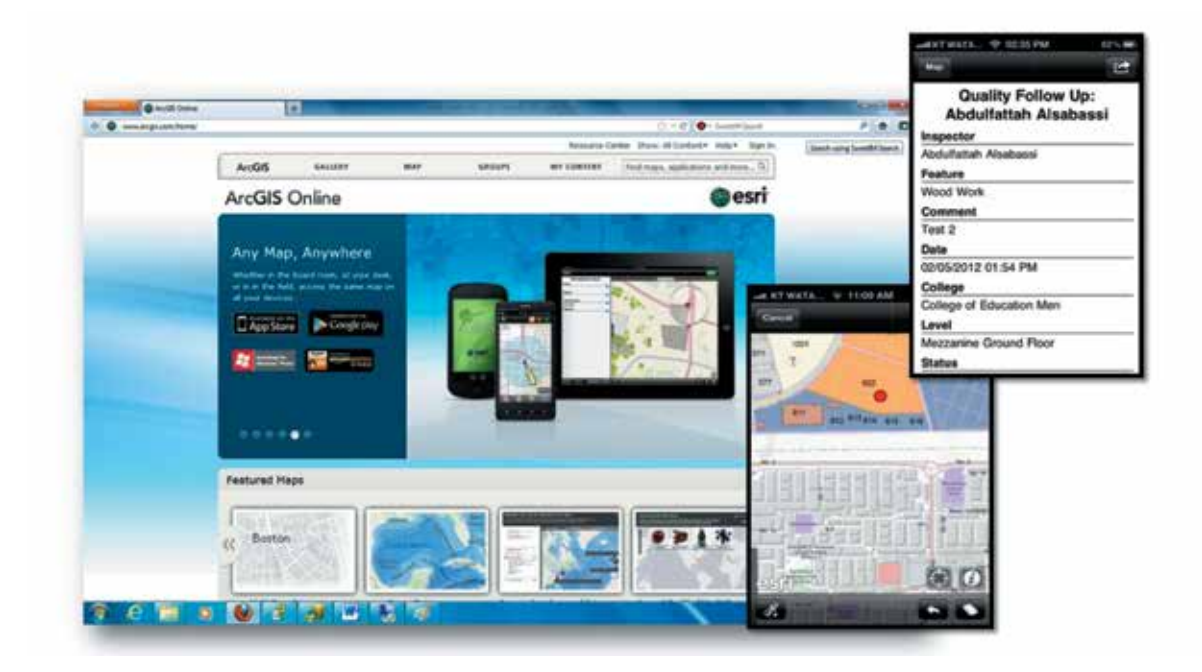
Fig. 2: ArcGIS Online and ArcGIS for iOS.