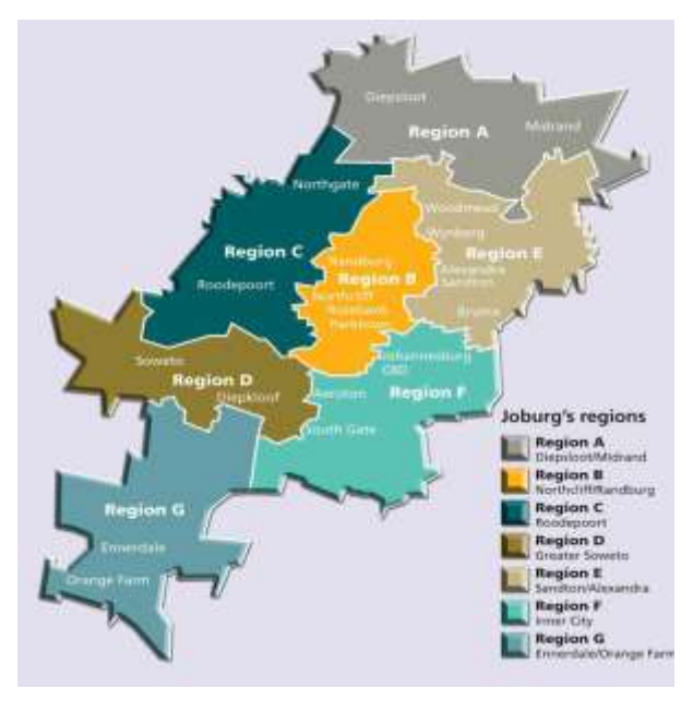
Figure 1: City of Johannesburg map (not to scale) [www.joburg.org.za, 2012]

Permission was obtained from Executive Director for Health to access the food premises files in the seven regions of the municipality (Region A - G). Figure 1 illustrates the map of City of Johannesburg Metropolitan Municipality, highlighting the seven regions of the city, where EHPs are employed to enforce food safety regulations in respond to food control as one of the municipal health services. The municipality appoints EHPs to implement food safety regulations mainly regulation relating to the general hygiene for food premises and the transport of food (Regulation No. 962 of 2012), hereafter referred to as R962/2012 and apply enforcement action for identified noncompliance.