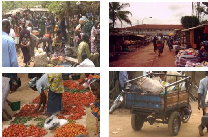
Figure 3. A market-street scene in southwest Nigeria

peers. Cities are political hotbeds, living in the cities afford the opportunity for taking part in the political process, where political ideas are hatched and cross fertilized. There is not one model how the city must be designed (Welter, 2002). Economic activities in many cities of the world are of concern because such activities is liken to one generation creating problem for another to contend with. Sustainable city should be an enjoyable city. It is a city people can move around easily. Improving public transport will help. Sustainability is a question of balance. It is achieving a sense of balance. City sustainability is a holistic concept that is focussed on successful use of available resources to enhance city's liveability. The source of many problems that plagued the city is not just technical related; hence they cannot be solved by technical means alone. Many of these problems are socio-political problems such as poverty, food shortage and lack of infrastructures. The food problem is not simply a technical one; hence we need to address them in a socio-political-economic ways (Figure 3).