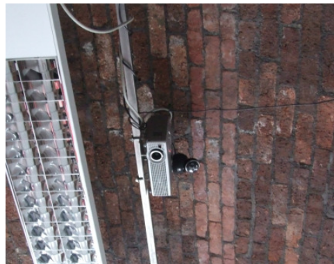
Figure 2 Ceiling-mounted projector and camera