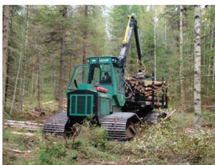
Fig. 3 Working environment of Finnish forest machine in the daytime

Fig. 3 shows the working environment of the Finnish forest machine in the daytime, and Fig. 4 shows the working environment in the evening.