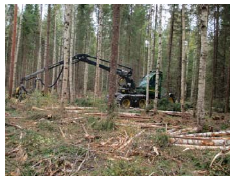
Fig. 1 Example of a forest machine

Not until recently have LED lamps reached a stage of development where they are efficient enough to be implemented in the lighting systems of forest machines (Fig. 1).