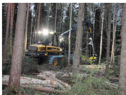
Fig. 4 Working environment in the evening