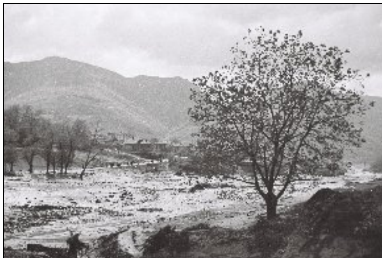
Fig. 2 – The area of Sgorigrad after the tailings dam failure (May 1966)

The mudflow destroyed most of the village of Sgorigrad, and eventually reached the town of Vratza. Rescue operations and recovery of casualties lasted several weeks. The corpses of the victims were taken to Vratza's stadium and their identification was a particularly difficult task [3]. The fact that the dam's collapse occurred around midday of 1 st May probably limited the number of casualties. However, this number was still rather high as most of the inhabitants of Sgorigrad were in the town centre taking part in the celebrations of Workers' Day. Officially, the number of lives lost was declared as 107 [4]. Over 2,000 persons were injured, 576 families were affected, 156 houses were destroyed together with Vratza's Zoological Garden.