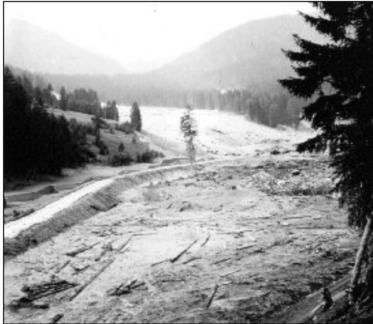
Fig. 3 – The Stava Valley completely devastated by the flowslide (July 1985)

some 20 to 40 cm thick, covered an area of some 435,000 m 2 over a length of 4.2 km. Some 180,000 m 3 of waste material spilled out of the tailings dams, to which another 45,000 m 3 of debris should be added resulting from erosional processes, destruction of buildings and uprooting of hundreds of trees (Fig. 3). The area where the dams stood and the path of the mud flow were completely reclaimed some years after failure.