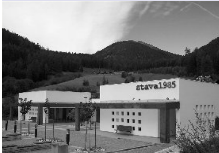
Fig. 4 – The Documentation Centre of the Stava 1985 Foundation