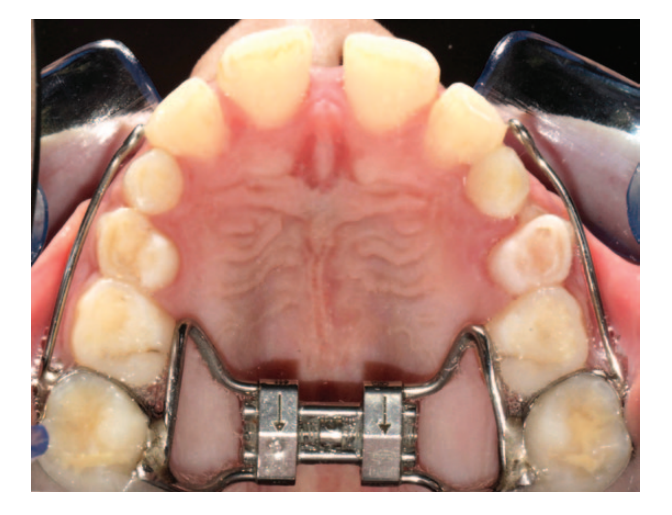
Figure 2. The banded expander.

vestibular hooks were present at the level of the deciduous canines. Patients' parents of both groups were instructed to activate the palatal expander 1/4 of a turn per day until overcorrection of the transverse width was achieved (palatal cusps of the upper posterior teeth approximating the buccal cusps of the lower posterior teeth). The screw was activated in both groups for an average period of 3 weeks.