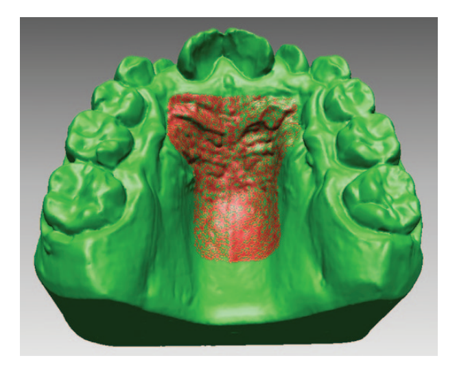
Figure 4. T-shape area comprising the palatal rugae and extending posteriorly along the palatal raphe used to refine the superimposition through a surface-to-surface approach.

To determine the method error, measurements on the digital models were performed by one trained examiner (LH) and repeated after an interval of approximately 2 weeks. A paired t -test was used to compare the two measurements (systematic error). The magnitude of the random error was calculated by using the method of moments' estimator (24).