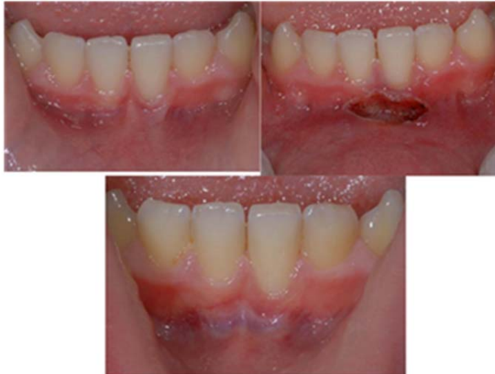
Figure 4. Lower lip frenum. 810 nm diode laser 2 W power in continuous mode, 320 \mu m fiber. Control at 3 months post-op.