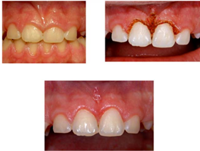
Figure 6. Gingivectomy. 810 nm diode laser 2,5 W power in continuous mode, 320 \mu\text{m} fiber. Control at 3 weeks post-op.

This treatment is performed with 810 nm diode laser on continuous mode at a power of 1-2,5 watt using a fiber of 320-400 \mu\text{m} (Figure 6).