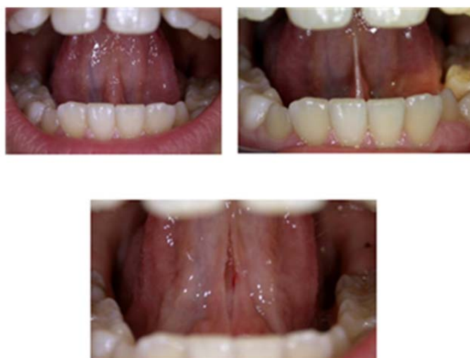
Figure 5. Lingual frenum. 810 nm diode laser 2 W power in continuous mode, 320 \mu\text{m} fiber.

The technique of lingual frenum removal with 810 nm diode laser is performed with a fiber of 320-400 \mu\text{m} and a power of 1.8-3W in continuous mode, through mobilization of the lingual corpse and rhomboidal cutting following anatomic levels [3, 6, 20], generally without infiltration of anesthesia and with only topical administration, recovery is reached by second intention and without any surgical suture. Immediately after the operation, the mobility of the tongue acquires physiological characteristics during the recovery period that lasts about two weeks. Patients will need to do exercises of the mobility of the tongue to prevent relapse and then start, eventually, logopedic rehabilitation (Figure 5).