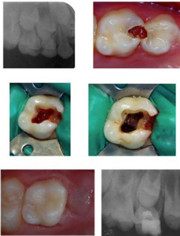
Figure 1. Maxillary second left primary molar pulpotomy. 810 nm diode laser cut of the pulp at root canal level at a power of 2 watt continuous wave, 320 \mu m fiber, control at 6 month post op.