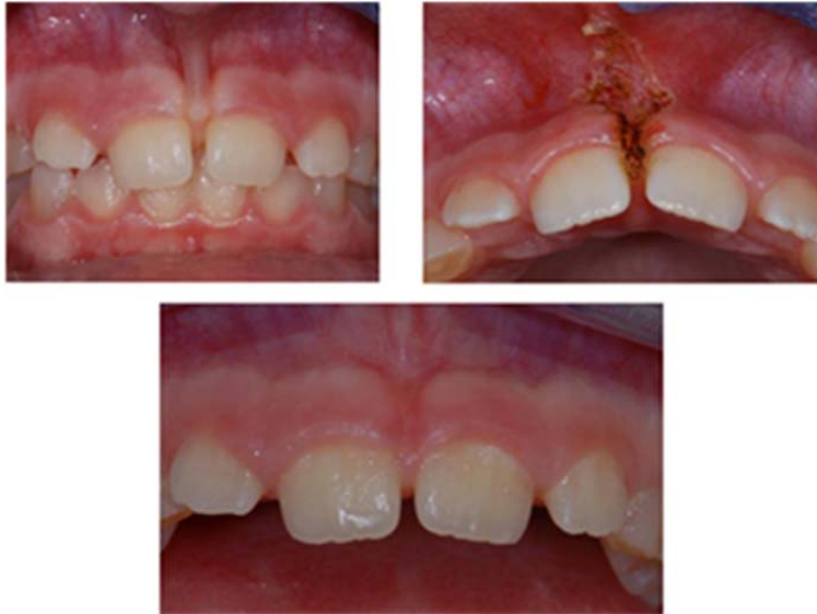
Figure 3. Upper lip frenum. 810 nm diode laser 2.5 W power in continuous mode, 320 \mu m fiber. Control at 3 months post-op.

When the insertion of this frenum is in a coronal position compared to the mucogingival line it can predispose to the development of periodontal complications, particularly in case it is associated to a thin layer of keratinized gingival [18, 19]. When gingival recession has been observed, the frenum seems to be a worsening factor. The laser aided surgery technique for lower labial frenum foresees the same steps as for the upper frenum.