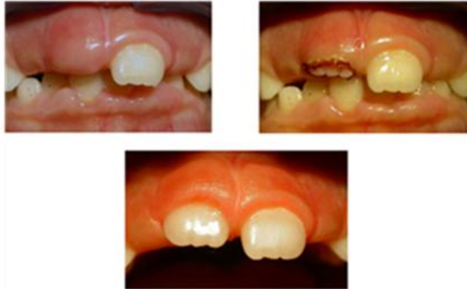
Figure 7. Tooth retention. 810 nm diode laser 3 W power in continuous mode, 320 \mu\text{m} fiber. Control at 2 months post-op.

The operation is performed with a 810 nm diode laser with a fiber of 320-400 \mu\text{m} and at a power of 1,6-3 W in continuous mode (Figure 7).