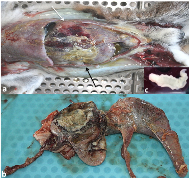
Fig. 1. a) Peritoneal cavity: exudative fibrinous-purulent peritonitis with haemorrhagic suffusions (white arrow) and fibrous adhesions (black arrow); b) Left: colon with thickened wall and necrotic-haemorrhagic mucosa. Right: constipated cecum; c) Taenia martis larva.

forms and transferred for molecular identification at the University of Rome “Tor Vergata”.