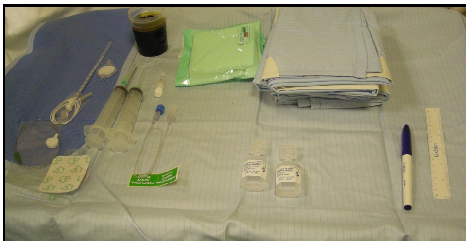
Fig. 1. Equipment

The patient should be in the supine position with legs spread slightly apart. After aseptic skin disinfection and sterile draping of the inguinal region, a local anesthetic is injected superficially. The stimulating needle insertion site is immediately below the inguinal crease, 1 to 2 cm lateral to the femoral artery pulsation. A 50-mm 18-gauge insulated stimulating needle is then connected to the peripheral nerve stimulator (PNS) with an initial current output of 1 mA (2 Hz, 0.1 ms). The stimulating needle has to be inserted with a 45° angle and advanced in a cephalad direction until quadriceps femoris muscle contractions were elicited (as evidenced by cephalad patellar movements). The needle position has to be adjusted until quadriceps femoris contractions are still elicited at a current of 0.5 mA or less. At this point, a 20-gauge catheter is introduced through the needle. The catheter is then advanced for 10 to 15 cm beyond the needle tip, needle is withdrawn and the catheter has to be secured in place. The local anesthetic of choice, has to be injected slowly through the catheter.