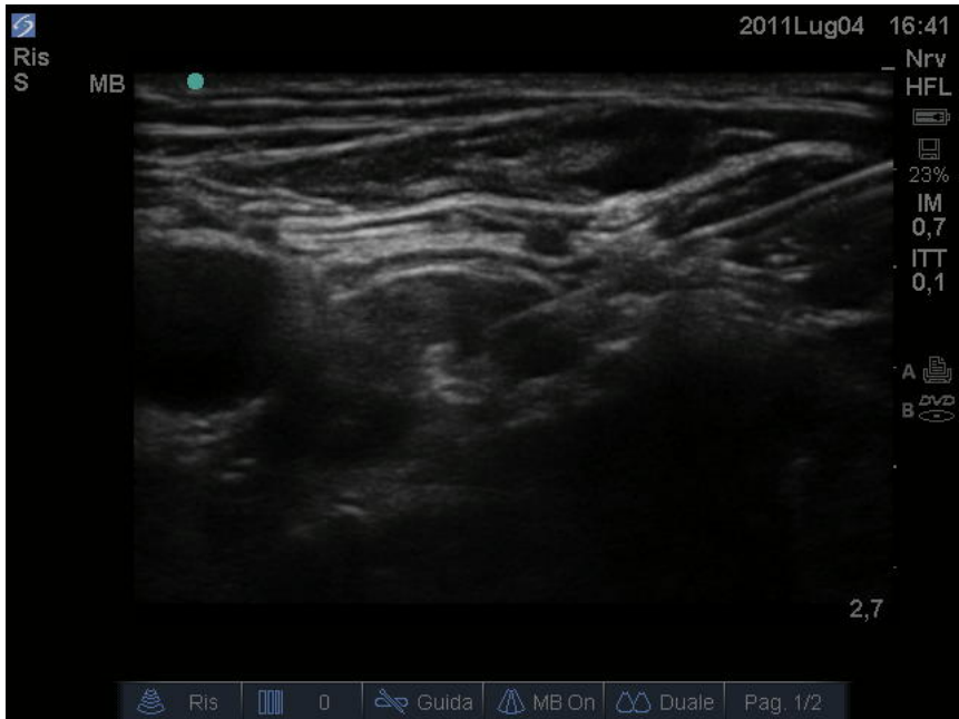
Fig. 4. Ultrasound guided femoral nerve block: needle insertion