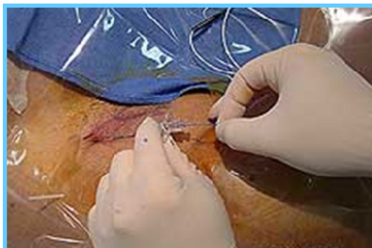
Fig. 2. Catheter placement

When stimulating catheter is being used, the catheter has to be connected to the PNS without changing the current output. The catheter is advanced 5 to 15 cm past the needle tip, and its position is adjusted until quadriceps femoris contractions are still elicited at a current output between 0.4 to 0.5 mA. At this point, the needle is withdrawn and quadriceps contractions are elicited via the catheter again to confirm the final perineural position of the catheter. (Dauri et al., 2007)