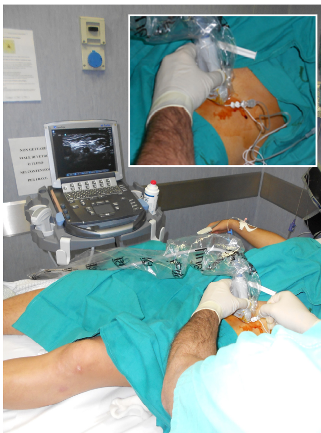
Fig. 3. Ultrasound-guided femoral nerve block: in plane approach

An alternative for assisting with correct catheter placement is ultrasonographic guidance (Fig. 3- 4- 5).