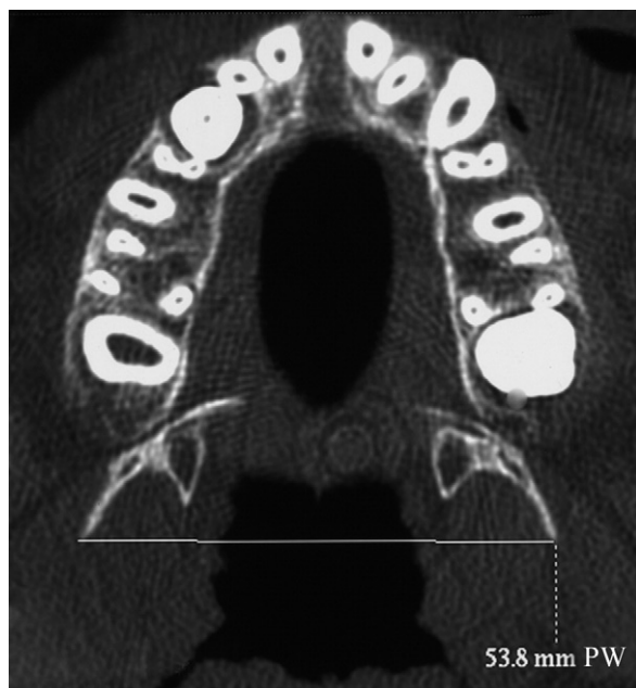
Fig 3. Measurement of pterygoid width (PW).