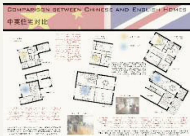
Fig.7 Residency comparison project 5

The third group of the projects was to do with the comparison of the life in the UK and China. One was to compare the residential models. It required students to study the details of daily life of a residential compound in Kunming and discover the difference between residential design in these two countries. In the site survey, students were particularly impressed by the intensely used courtyard in the compound, where the residents exercise, dance and sing every morning and evening. They then worked with the administration group in the compound to work out a better layout for the public space (Fig.7).