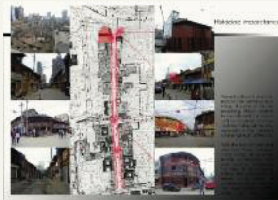
Fig.5 Wenmin street project 3

Rapid urban development has erased much traditional architecture and urban fabric. Due to the lack of effective policy of conservation and protection, traditional urban fabric is rapidly replaced with wide roads that lie on both sides with high rise apartments and modern shopping malls. Under the current commercial pressure, to find solutions to protect and renew the district is an urgent task.