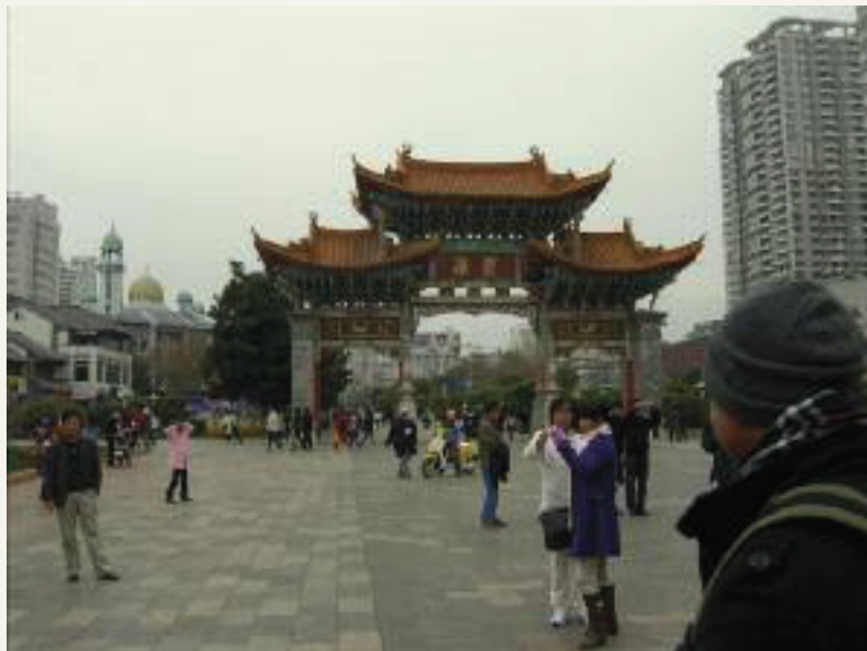
Fig.3 Kunming in 2009

Four projects were also set up to investigate the tensions between traditional and modern and urban and rural life in the country. In China, according to Liauw, “400 new cities will be built over the next 20 years with newly urbanised populations of over 240 million” (Liauw 2008). In Kunming, new roads with high rise apartments and offices rapidly replace traditional urban fabric and courtyard houses. Contrast to what happened in Kunming, in small towns, such as the Old Town in Lijiang that students visited in the same trip, the indigenous tradition has been celebrated and reinvented for the tourism industry. The category of old and new or tradition and modernity are clearly marked and amplified. The boundary of the local identity has been pushed, and kept generating new meanings (Gao 2008) (Fig.3 and 4).