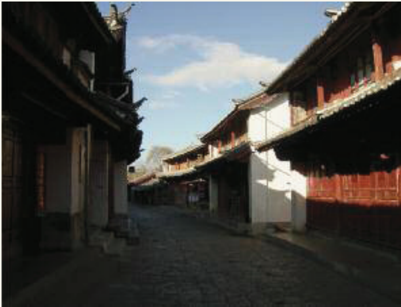
Fig.4 Lijiang in Yunnan province 2008

One project investigated the impacts of urban changes on traditional buildings. Wenmin Street was a Chinese traditional street full of courtyard houses. During the early 1980s, the flow of people and materials doubled with the economic development in Kunming, large amount of new residential quarters were built in a relatively short period to meet the urgent needs. Many locals who lived in old courtyard houses were willing to move into those new apartments. Because in most cases, the old houses in both the cities and towns were dilapidated, overcrowded and had a lack of basic hygiene and cooking facilities. Without enough funding for preservation or refurbishment to cater for the needs for the contemporary life, the householders saw their houses as obsolescent and backward and did not reflect their expected new ways of life. After the 1990s, however, not until large areas of traditional structures were removed and replaced by high rise buildings, did people start to revalue and appreciate the traditional courtyard houses. In this case, students learnt to study the relationship between architecture and people's daily life rather than simply labelling a building as traditional or modern. They commented that the only response to the stereotype of a Chinese curved roof could not give answers to the identity of a place (Fig.5).