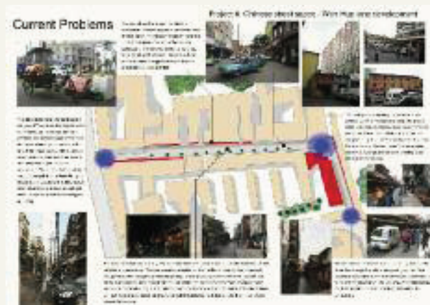
Fig.6 Wen Hua Lane Project 4

The third group of the projects was to do with the comparison of the life in the UK and China. One was to compare the residential models. It required students to study the details of daily life of a residential compound in Kunming and discover the difference between residential design in these two countries. In the site survey, students were particularly impressed by the intensely used courtyard in the compound, where the residents exercise, dance and sing every morning and evening. They then worked with the administration group in the compound to work out a better layout for the public space (Fig.7).