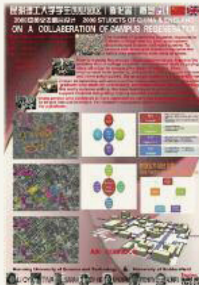
Fig.9 Campus regeneration project 7