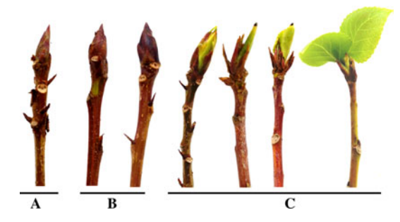
Figure 1. Populus nigra phenological stages assessment by bud development analysis: winter buds, stage A (February, T_0 ); swelling buds, stage B (March, T_1 ); flushing buds, stage C (April, T_2 ). Bud development was quantified using six levels of morphology score (0–6); minimal score (0) was given to the winter bud and maximum score (6) to buds with a growing stem.

In our earlier papers (Trupiano et al. 2012a, 2013b), we analyzed the effect of bending on the proteomic profile of poplar roots by performing a differential study with respect to non-bent counterparts; this study was carried out on time-course basis by analyzing the tissues from plants under a dormancy (T_0) , beginning of vegetative growth (T_1) , and active growth (T_2) condition, which are represented here according to their corresponding shoot phenology (Figure 1). Data related to unbent roots were simply used as a background to be subtracted to the whole proteomic data-set of the bent counterparts, with the aim to identify specific elements associable with root bending. Interpretation of the differential results for unbent roots at the three time points was achieved later; this is the topic of the short communication reported here.